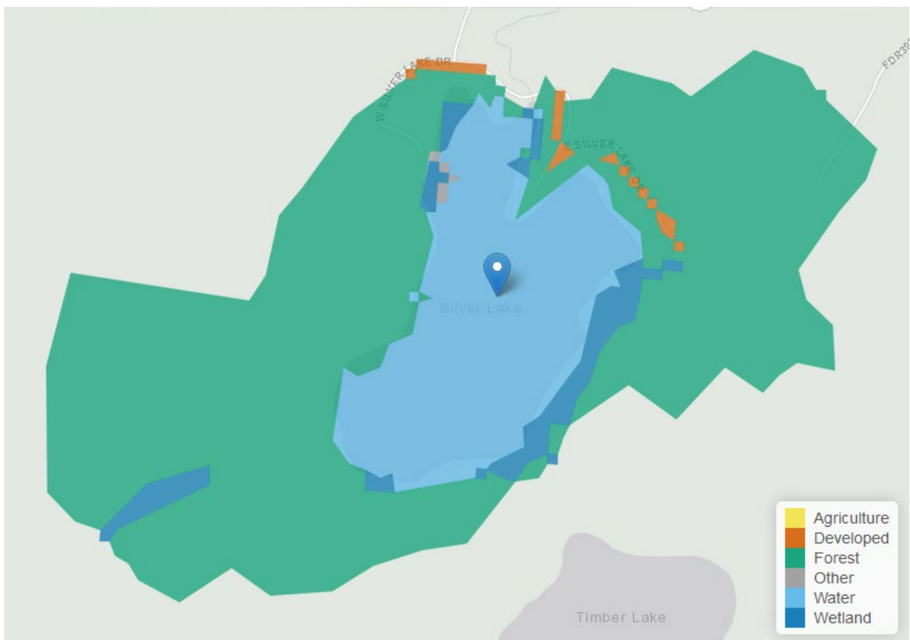
Figure 1. Land use map of Silver Lake.

The water quality of a lake is impacted by processes that occur both within the lake and the surrounding watershed. A watershed is all of the land and water area that drains to the lake. Land use in the watershed can greatly impact the water quality of a lake, especially if the land use activity changes the landscape drastically from its natural state. Land use in the watershed surrounding Silver Lake consists of 0 percent agriculture, 1 percent developed, 72 percent forest, 0 percent other, 22 percent water, and 4 percent wetland (Figure 1).