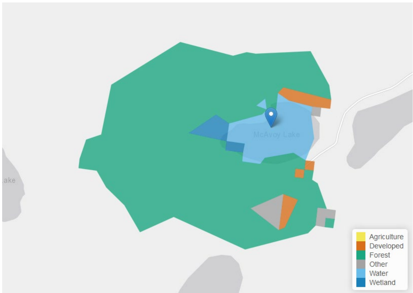
Figure 1. Land use map of McAvoy Lake.

The water quality of a lake is impacted by processes that occur both within the lake and the surrounding watershed. A watershed is all of the land and water area that drains to the lake. Land use in the watershed can greatly impact the water quality of a lake, especially if the land use activity changes the landscape drastically from its natural state. Land use in the watershed surrounding McAvoy Lake consists of 0 percent agriculture, 3 percent developed, 83 percent forest, 3 percent other, 10 percent water, and 2 percent wetland (Figure 1).