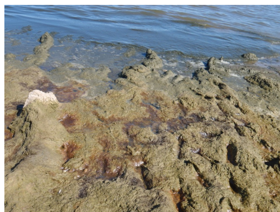
Upper Picture: Goose Lake in Marquette County, Michigan. Lower Picture: Lake Michigan shoreline in 2012.