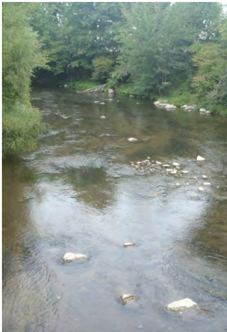
Looking Glass River at Monroe Road