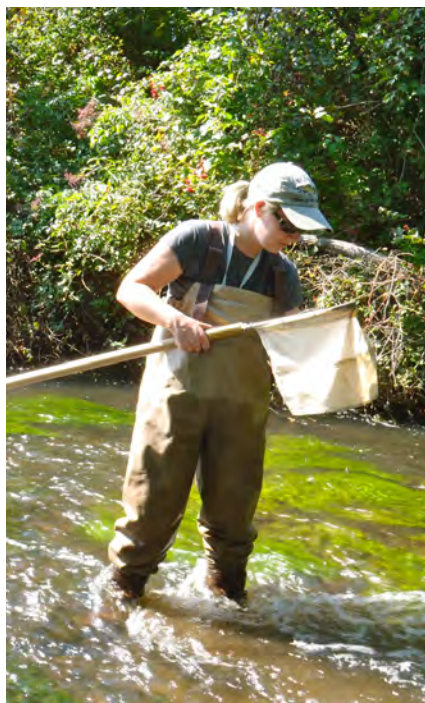
MDEQ employee sampling a Michigan stream

Routine sampling of the Looking Glass River Watershed occurs every five years to evaluate stream condition or health. Sampling occurred in 2002, 2007, and 2012 and will occur again in 2017. The aquatic macroinvertebrate community and habitat condition are shown in the graphs to the right. A map on the last page depicts macroinvertebrate condition at specific stream locations. To request a copy of the full report, please contact the DEQ staff noted at the bottom of this fact sheet.