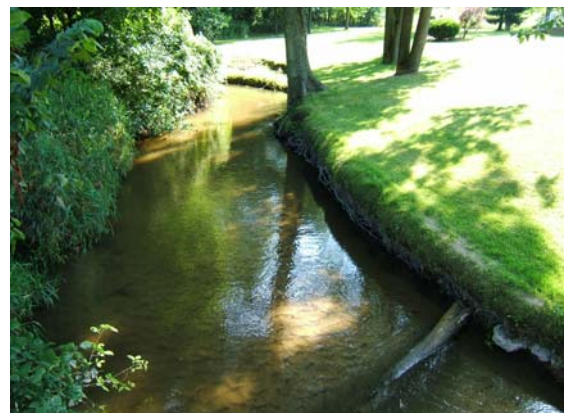
Figure A: Green Lake Creek upstream of 11 th Street.

Green Lake Creek was sampled at 142 nd Avenue (Station 2) and at 11 th Street (Station 3). The riffle/run habitat at Station 2 scored at the lower end of good (109; slightly impaired; Table 2a). The substrate consisted of sand and gravel riffles embedded approximately 50% with sand. The right stream bank was reinforced with concrete rip rap as the stream flowed closer to 142 nd Avenue. Bank scour evidence suggested that the channel flow was somewhat flashy. The riparian area consisted