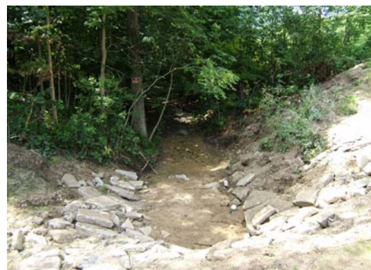
Figure D: Winks Brook at 138 th Avenue

Winks Brook is a small intermittent tributary to the Rabbit River. Observations of this site indicated that a possible culvert replacement had occurred and no silt fences or other sedimentation control Best Management Practices were implemented. A large amount of sediment from the road and construction was in the dry stream bed (Figure D).