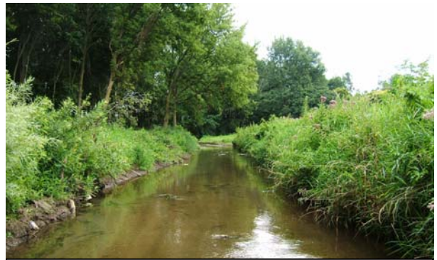
Figure B: Bear Creek at Hopkins Village Park upstream of Godfrey Road.

Bear Creek was sampled at a park in the village of Hopkins (Station 9). The park is just downstream of an agriculture feed supply company that is located directly adjacent to the creek. The glide/pool habitat at Station 9 was rated marginal (70; moderately impaired; Table 4a). Several areas along the stream bank had recently been reinforced with riprap to prevent erosion. The stream channel was very straight and uniform with very little pool variability and was incised approximately 8 feet (Figure B). The riparian area was impacted on both sides by the park. A five-foot wide grassy area was left as a riparian buffer. Bank scour evidence and areas of erosion suggested that the channel flow was somewhat flashy. The macroinvertebrate community scored acceptable (0; Tables 4b and 4c).