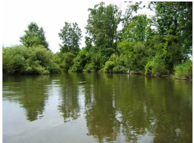
Figure C: Rabbit River downstream of 30 th Street.

Station 13 was sampled downstream of 30 th Street. The glide/pool habitat at Station 13 was rated marginal (82; moderately impaired; Table 5a). The river was very wide and slow with pools more than 6-foot deep (Figure C). Sand once again dominated the substrate; however, clay deposits were present and there was a layer of silt on top of the sand. Cobble, gravel, and leaf packs were absent and there was very little woody debris. A portion of the riparian area was impacted by a yard and row crops that had a 10-foot buffer. On the south side of the river, the banks were more than 50-feet high in places and were eroding. The habitat at this station was very different and much less suitable for macroinvertebrate colonization than that at Station 12, which was located just two miles upstream. Station 13 had more sedimentation, less woody debris available for epifaunal substrate, less pool diversity, and a reduced amount of riparian vegetative protection when compared to Station 12. Station 13 was also much wider, slower, deeper, and had more silt and clay. The macroinvertebrate community scored acceptable (0; Tables 5b and 5c).