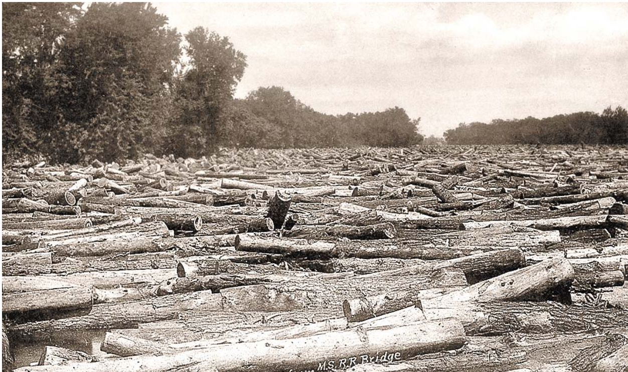
Figure 2. Portion of massive log jam in Grand River that occurred in 1883.

through the city of Grand Rapids: The Sixth Street Dam and the beautification dam set. Construction of the Sixth Street Dam began in 1849, with the placement of rocks, logs, and brush in the channel. The final structure was completed in 1866. The Sixth Street Dam was originally used to divert impounded water to canals to the east and west of the river that powered sawmills. The dam is now classified as a retired hydroelectric dam and maintains about eight feet of hydrologic head (Figure 3). The beautification dam, which is actually a set of 4 separate structures located in close proximity to each other, was constructed in 1931. The beautification dam structures only serve aesthetic purposes (Hanshue and Harrington, 2011). The impacts of low-head dams in general, such as flow and sediment transport disruption, increased downstream scouring, impoundment temperature increases, increased evaporative water loss from the impoundment, changes in macroinvertebrate communities, and fragmentation of fish communities are well documented (e.g., Allan, 1995). In the Grand River, construction of the dam in Lyons (just upstream of the Lower Grand River study area) had detrimental impacts on native mussel populations (van der Schalie, 1948). Hanshue and Harrington (2011) noted that the beautification dam structures may impede native fish movement during periods of low flow. Currently, plans are underway to remove the Sixth Street Dam and beautification dam structures.