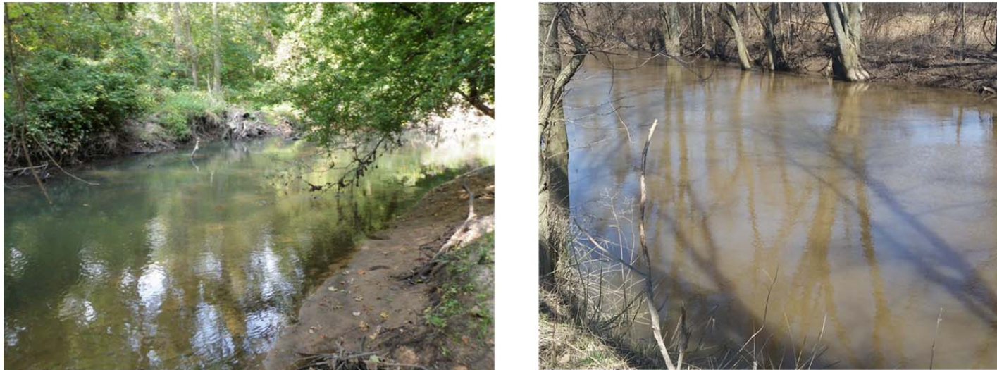
Figure 4. Crockery Creek, Ensley Road site (Station 8). Photo on left is from August 2009 and photo on right is from March 2016.

type was mostly sand (95% visual estimate). The greater surrounding area contains a mix of forest and agricultural land use. This site was sampled in 2009 with the macroinvertebrate community scoring acceptable (0) and habitat scoring marginal (104; Rippke, 2011).