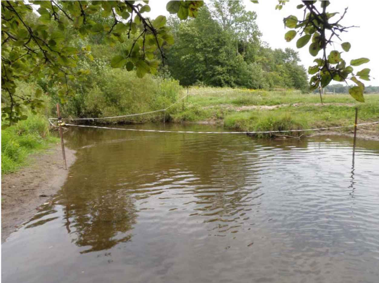
Figure 5. Photo of restricted, but direct access for horses in a section of North Branch Crockery Creek near 24th Avenue during 2009 survey.

At Station 16 the macroinvertebrate community scored acceptable (1; Table 4) and habitat scored good (119; Table 6). This site was sampled in 2009 and macroinvertebrates scored poor (-5) and habitat scored low good (106). In 2009, the macroinvertebrate community was dominated by Amphipoda and only one Ephemeroptera and one Trichoptera family were collected. In 2014, the macroinvertebrate community was still dominated by Amphipoda; however, three Ephemeroptera and three Trichoptera families were collected. The current results indicate moderate disturbance at the site, but the conditions may be improved since the last sampling event. During the 2009 survey, biologists observed that horses were allowed access to a section of the stream (Figure 5; Rippe, 2011).