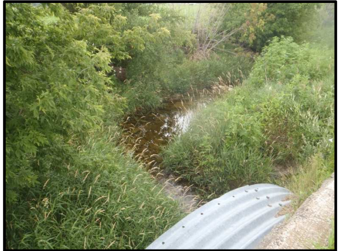
Figure 4. Squaconning Creek downstream of Fraser Road (Station 2).

An objective of the 2014 biological survey of the Saginaw River tributaries was to identify sources of pollution that are, or have the potential to, adversely impact biological, chemical, or physical integrity of the river system. No specific nonpoint source-targeted projects were identified by the MDEQ staff for monitoring. In general, agricultural and urban development within these watersheds has overwhelming effects on hydrology and water quality. Historic physical channel manipulation (straightening) also continues to homogenize available habitat within these streams.