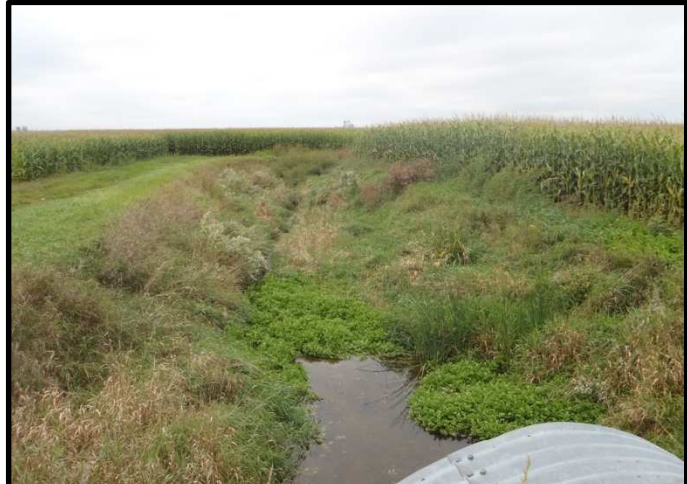
Figure 2. Unnamed tributary to Richville Drain, upstream of Quanicassee Road (Station 6).

Habitat quality at the probabilistic sites was rated as marginal (5 sites) to good (2 sites). Similar to previous studies by Walker (2011), Roush (2008) and Morse (1994), scores were negatively impacted by dredging and channelization, and stream morphology of the sampling reaches was largely homogenized (Table 3). Where present, epifaunal substrate was largely embedded in fine sediments and gravel and cobble were sparse throughout the watershed. Reaches were also characterized by flashiness and narrow (i.e., <10 feet) riparian zones adjacent to urban or agricultural land (Figures 2 and 3). Water was typically stagnant or slow-moving and algal growth was often extensive.