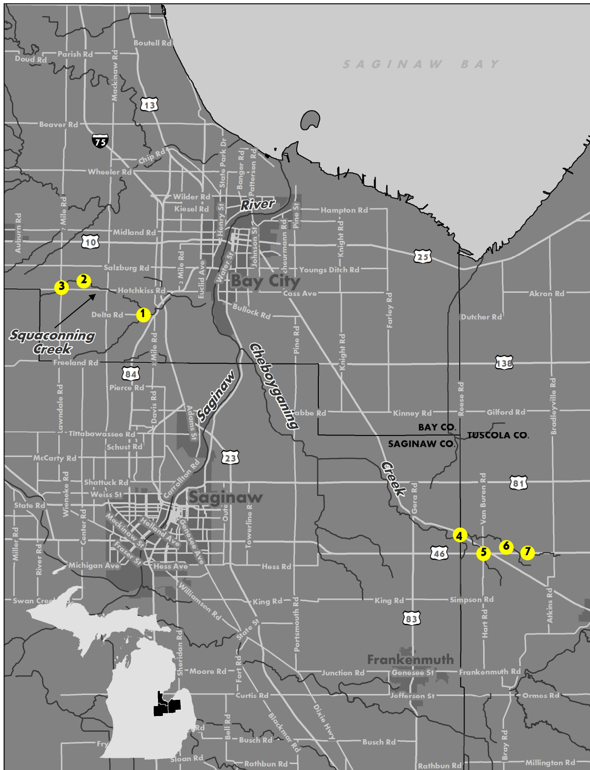
Figure 1. Map of Saginaw River tributary monitoring stations.