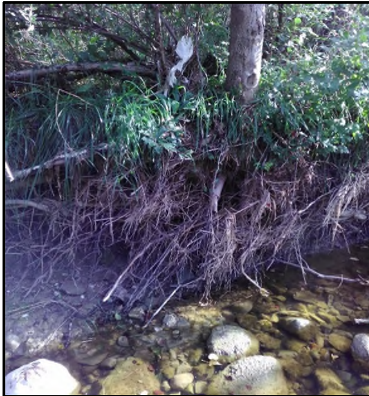
Figure 3. Elm Creek at Eppenbrock Road.

woody debris was present throughout the sample reach (Figure 3). Similar to Stations 5 and 6, stoneflies were absent and there was a low abundance of mayflies. There were five families of caddisflies found, with Helicopsychidae being the dominant family within the order Trichoptera at 91 percent. However, physid snails made up 27 percent of the sample overall, suggesting nutrient enrichment in this reach. Isopods, snails, and leeches again made up a high proportion of the macroinvertebrate community at 36 percent. One unidentified juvenile unionid mussel was present, suggesting local reproduction in this reach. The macroinvertebrate community at this location reflected improved habitat, relative to other stations, and scored as acceptable.