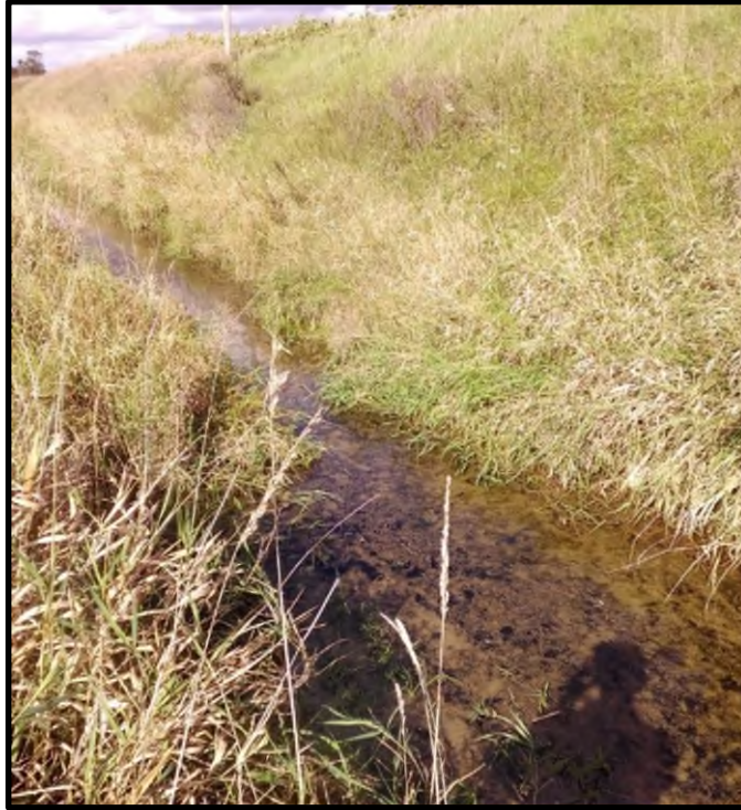
Figure 2. Pinnebog River at McMillan Road.

absent. There were no stoneflies or caddisflies present at this site, and the single mayfly found was in a family that is often found in disturbed streams. Isopoda (aquatic pillbugs), Gastropoda (snails), and Hirudinea (leeches) are tolerant taxa and are considered indicators of disturbance when found in high numbers. These three taxa made up 37 percent of the sample, with isopods being the dominant taxa in the sample at 31 percent.