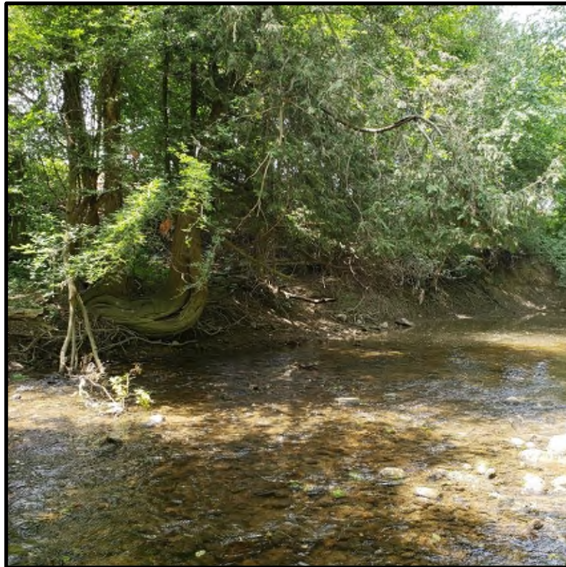
Figure 4. Pinnebog River at Grassmere Road.

toward the low range of acceptable. Of particular note amongst the trend sites was Station 4, Pinnebog River downstream of Grassmere Road. This location achieved the highest habitat score of any site visited during this survey. Substrate was dominated by gravel and cobble in a shallow riffle conducive to epifaunal colonization (Figure 4). A modest riparian buffer comprised of trees and woody shrubs was also present, providing canopy cover and shade to the river. Moreover, several sensitive taxa (e.g., caddisflies, stoneflies) were detected at this location, indicating that the diversity of the aquatic macroinvertebrate community benefited from the favorable habitat conditions. Habitat and macroinvertebrate community scores for all trend sites can be found in Tables 3, 6a, and 6b.