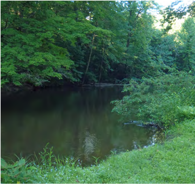
Paw Paw River (T. Lipsey MDEQ)