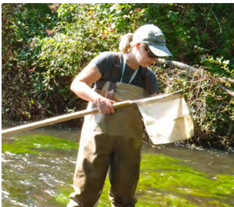
MDEQ employee sampling a Michigan stream