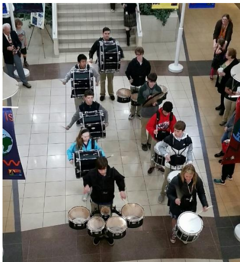
Drumming up the beginning of another Earth Day.