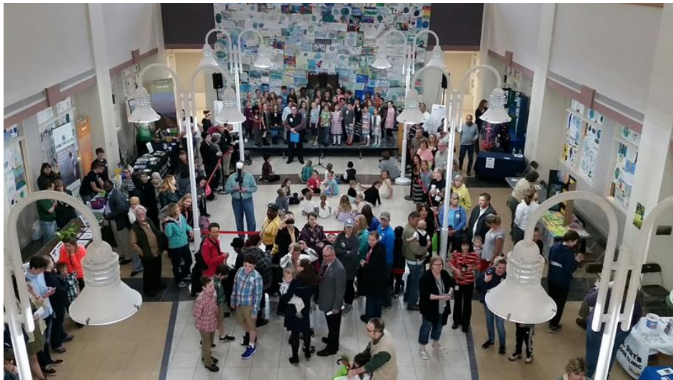
Ready for the Earth Day 2017 Opening Celebration to officially begin.

The special activities of the day got started early, sometime around 8:00 a.m. It seemed that every program housed and being administered by State Departments in Constitution Hall may have had a display of some kind as part of the whole Earth Day Celebration. MDEQ floodplain staff provided day-long demonstrations to the youth and old alike through the day. The floodplain watershed model can imitate several flood type scenarios depending on the type of landscape precipitation module used in the watershed head waters and the extent of inserted development types placed in the downstream floodplain. It is a very visually oriented learning tool that persons of all ages can readily see obvious results from wise and unwise landscape manipulations within a watershed.