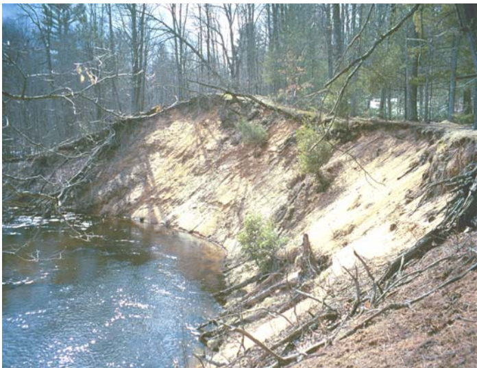
Site 30 Before

Description: Site 24 downstream after stabilization with 120 cubic yards of rock riprap, spanning a distance of 175 linear feet.