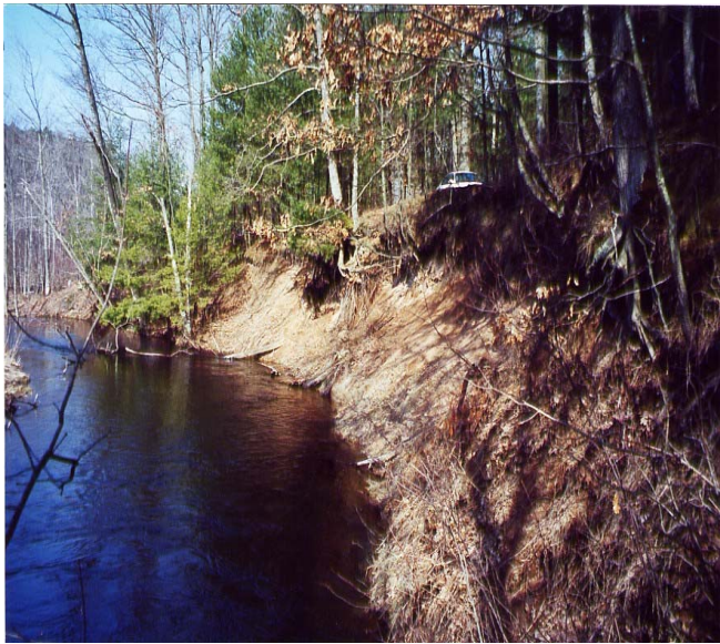
Site 24-A Before

Description: Site 24 downstream prior to stabilization.