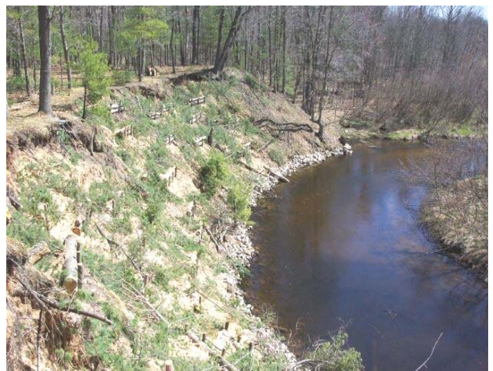
Site 30 After

Description: Looking at Site 30 (downstream) prior to bank stabilization.