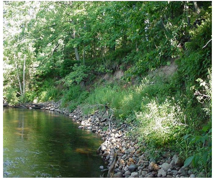
Site 24-A After

Description: Site 24 downstream prior to stabilization.