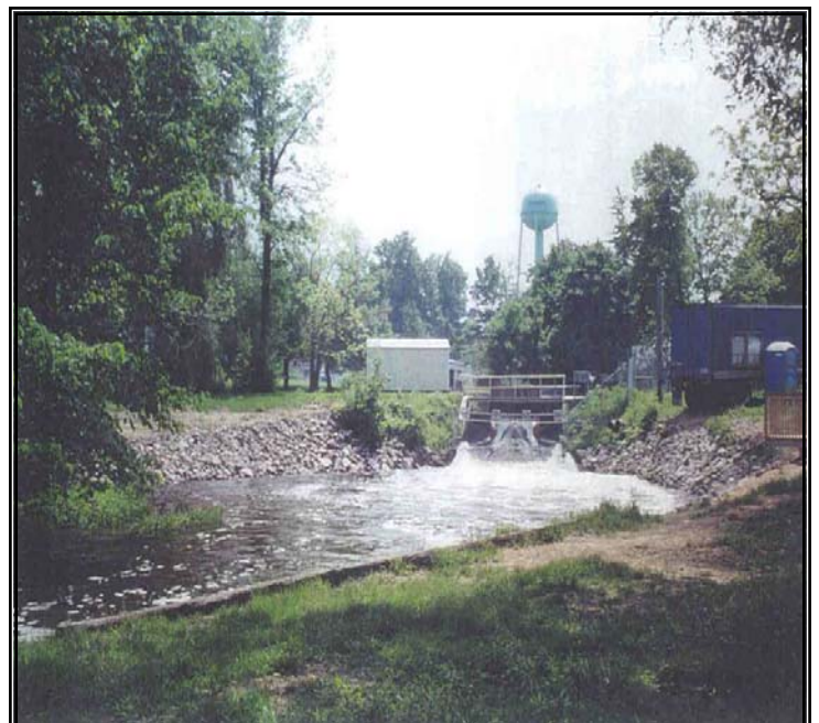
2001: Erosion was eliminated by bank shaping, geotextile placement, rock riprap, and establishment of native plant species.