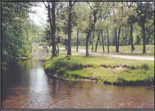
1999: Sediment from this eroding stream bank was being washed into the river, which covered potential habitat for organisms requiring a rocky stream bottom.