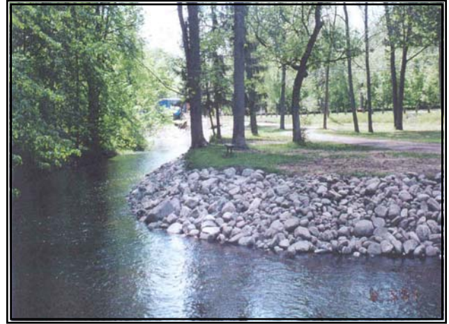
2001: The bank was stabilized with bank shaping, geotextile fabric, and rock riprap.