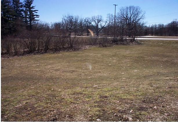
Laraway-Brooklyn Project - Alger/Kalamazoo Sediment Basin (October 1999)