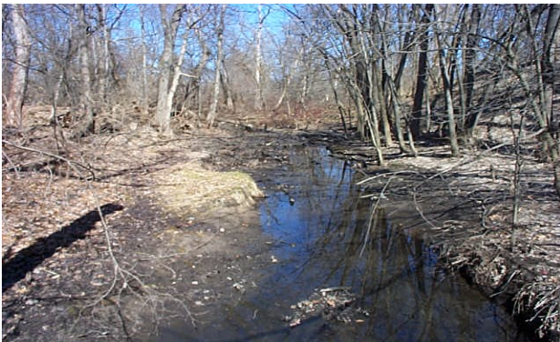
Laraway-Drain: Looking upstream from bridge crossing (October 1999)