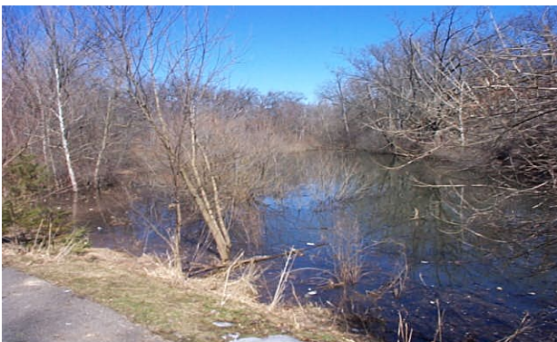
Deep Pool - Looking upstream from outlet (October 1999)