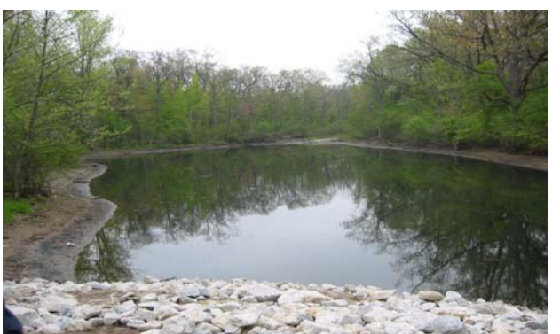
Deep Pool - Looking upstream from outlet (May 2003)