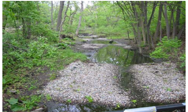
Laraway-Drain: Looking upstream from bridge crossing (May 2003)