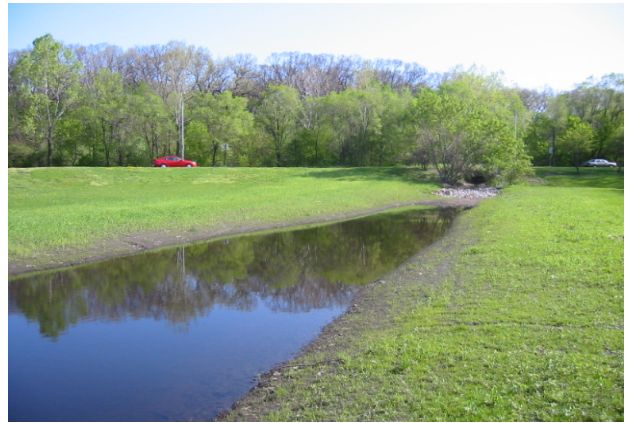
Laraway-Brooklyn Project - Alger/Kalamazoo Sediment Basin, low flow channel within grassed sediment basin (May 2003)