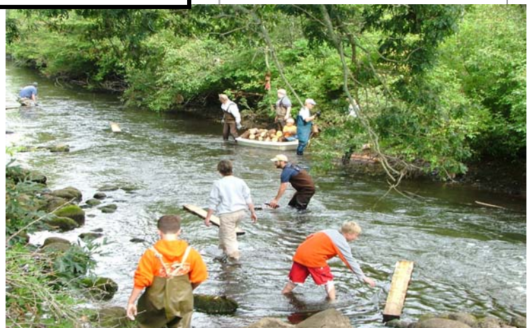
Trout Habitat Project, Rice Creek