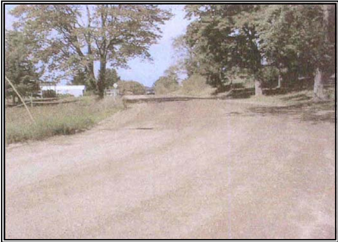
Before: Runoff from dirt/gravel road was entering the Clam Creek due to the use of un-anchored sediments as road surface.