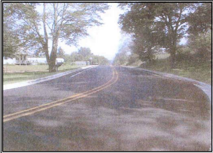
After: Bituminous paving was implemented to correct the runoff problem.