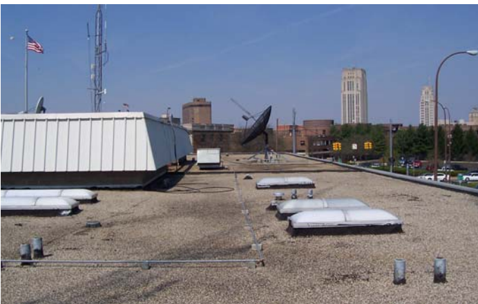
Police Dept Roof - Before