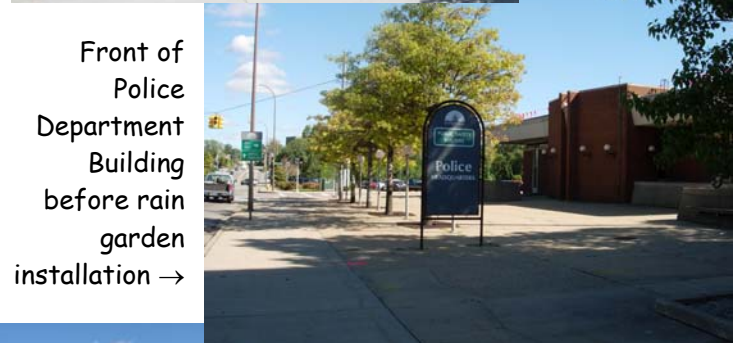
Front of Police Department Building before rain garden installation →