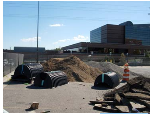
Underground storm water collector and recharge polyethylene chambers