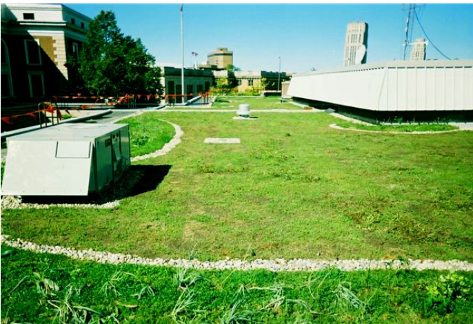
Police Dept Roof - After, with vegetated roof system