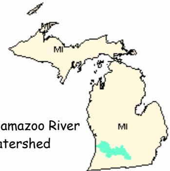
Kalamazoo River Watershed