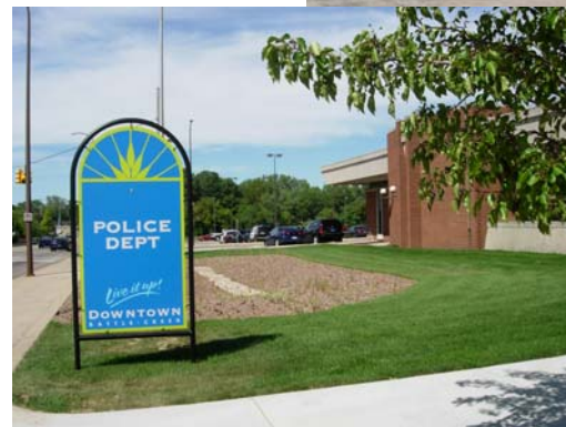
← Rain garden installation in front of Police Department Building