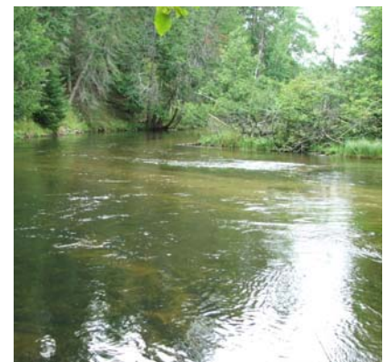
Au Sable River