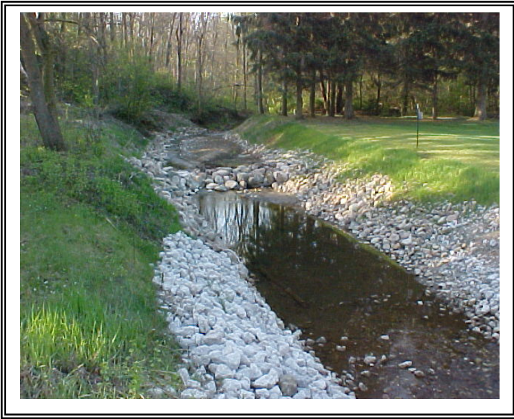
The upstream section of the Berry Lake inlet after stabilization and the placement of a rock weir took place.