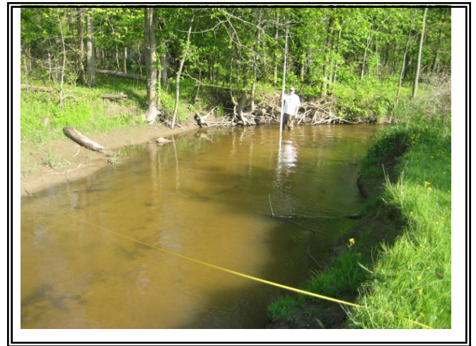
Green Lake Creek - Impaired Reach from WARSSS RRISSC.