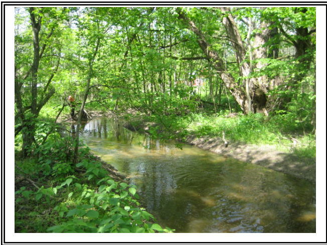
Green Lake Creek - Reference Reach from WARSSS Rapid Resource Inventory for Sediment and Stability Consequence (RRISSC) phase.