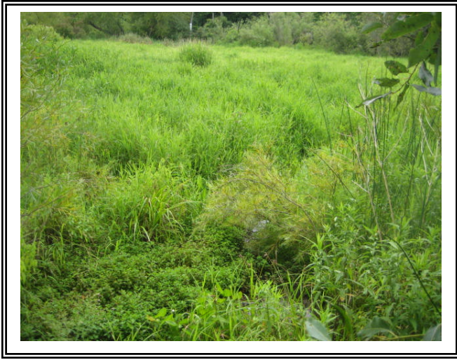
8-13-08 Wetland Restoration on Vanderzwaag Property.