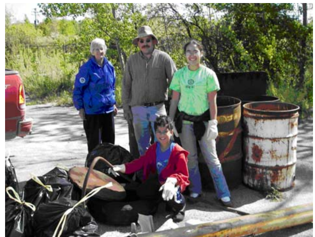
Fifty-five tires, five barrels, a toilet and much more trash were collected at two sites during the Bear Creek Watershed Cleanup.