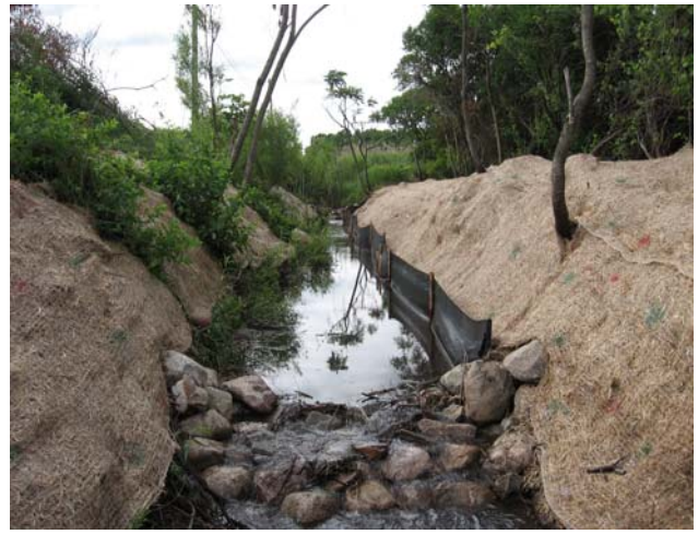
Site BC2 (After): Three (3) check dams were placed along this tributary of Bear Creek; the bank was reshaped, seeded with native grasses and covered with an erosion control blanket.