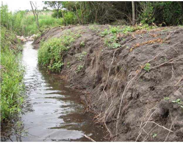
Site BC2 (Before): This eroding streambank was contributing sediment to Bear Creek. The severe slope and sandy conditions were contributing to the bank erosion.