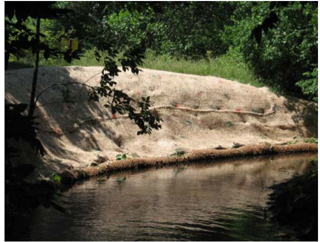
Site 17 (After): Coir (Fiber) Logs were installed to stabilize the toe of the bank. The upper bank was reshaped, seeded with native grasses and covered with an erosion control blanket.