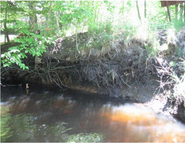
Site 17 (Before): Undercutting was occurring on this streambank and was causing the upper bank to collapse, contributing sediment to Bear Creek.