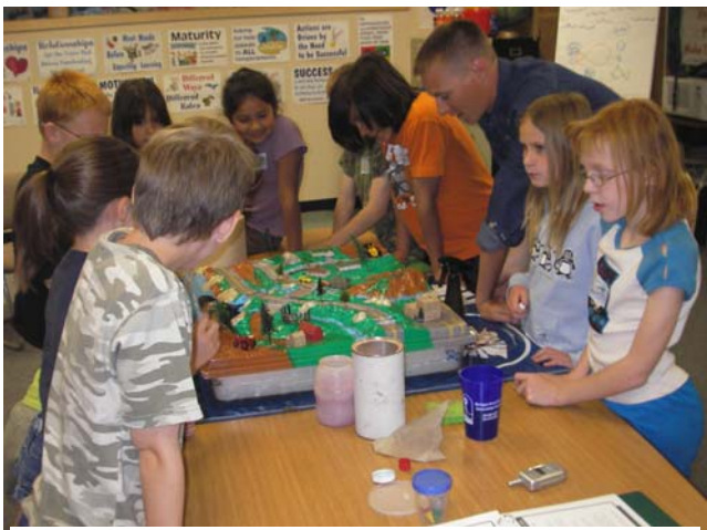
Students at Twin Lake Elementary participated in five water quality sessions at the Bear Creek Watershed Festival.