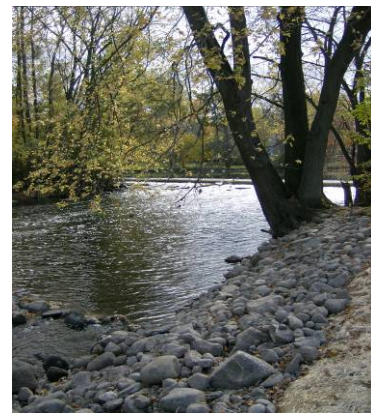
Parking Lot #7: River Bank Stabilization.