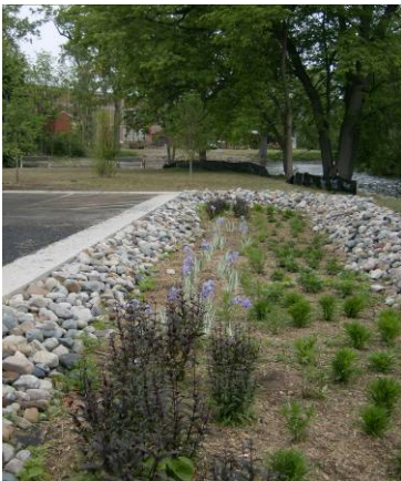
Parking Lot #7: New Rain Garden.