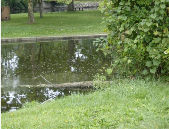
Parking Lot #6: Grand River bank erosion.