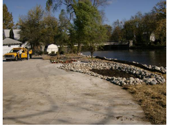
Parking Lot #6: Porous concrete parking lot with rain gardens and river bank stabilization.