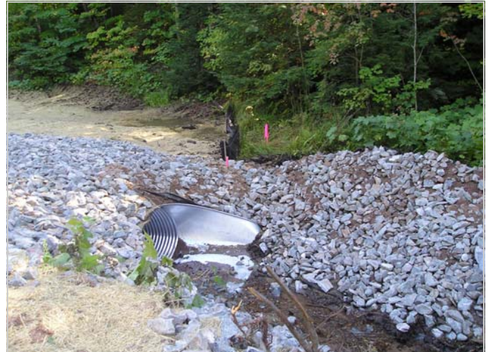
Site #11 - Reany Creek/County Road 510 culvert replacement ('08).

Before - Headwall collapsed causing an obstruction in-stream; sediment deposition from road.