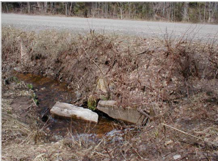
Site #11 - Reany Creek/County Road 510 culvert replacement ('08).

After - Banks were reshaped and toe of slope stabilized with large boulders; banks were restored with mulch blanket and native seed mix.