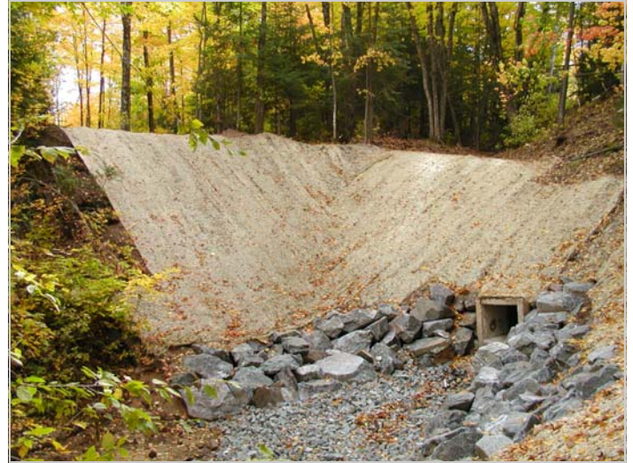
Site #22 - Midway Creek/LS&I Railroad Crossing ('06).

Before - Outlet of culvert was impounded due to erosion occurring at the top slope of the bank.