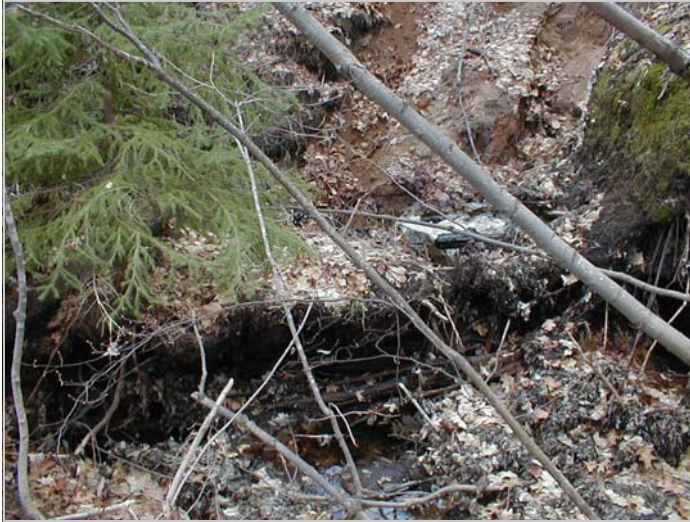
Site #22 - Midway Creek/LS&I Railroad Crossing ('06).

Before - Outlet of culvert was impounded due to erosion occurring at the top slope of the bank.