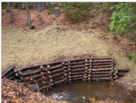
Photo of cribwall installation on Nordwald Creek, October 2008