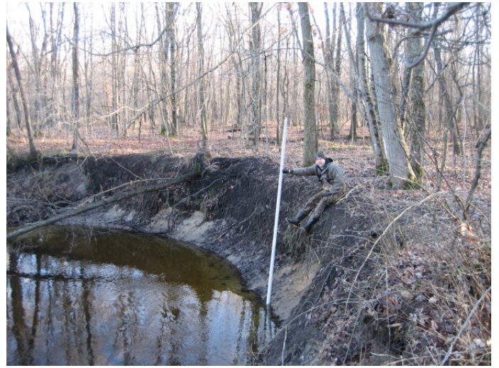
Bank erosion in Black Creek