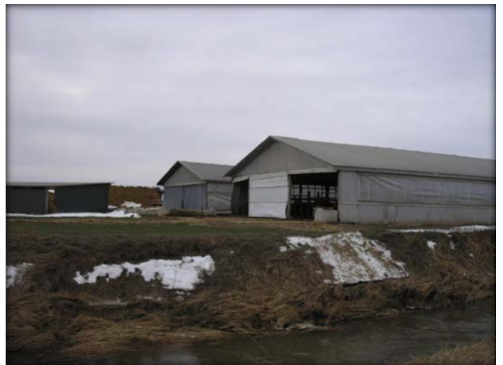
Potential source and cause for E. coli contamination