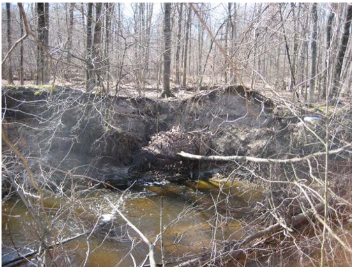
Sediment load into Lincoln Lake Drain