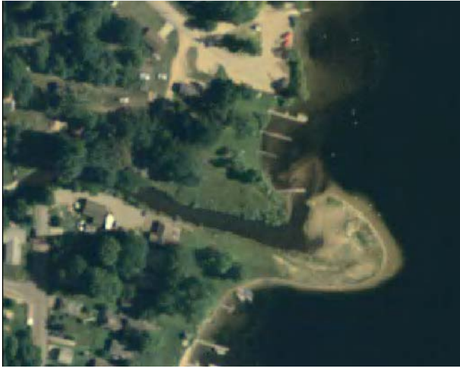
Sediment load into Lincoln Lake