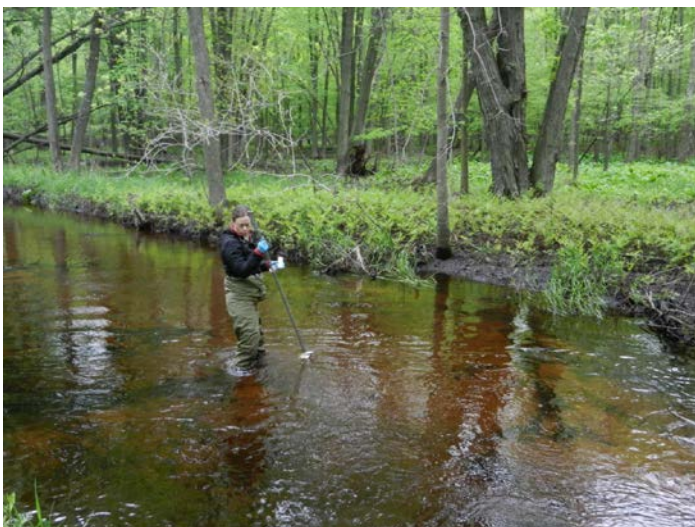
E. coli sampling