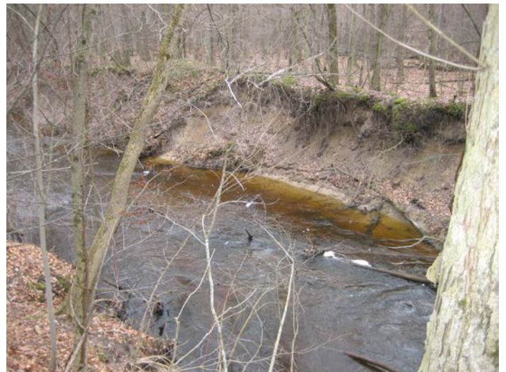
Eroding and downcutting channel in Black Creek