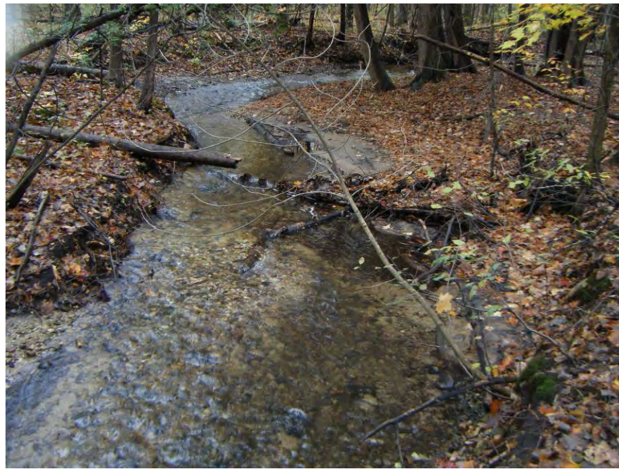
Bennett Creek on Bennett Creek Meadows CE #1