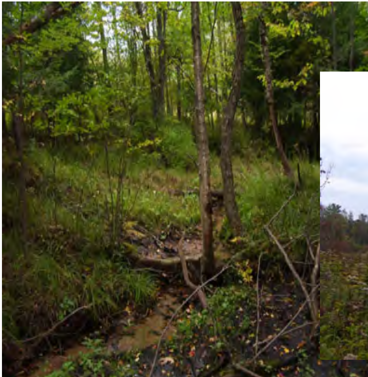
Bennett Creek on Bennett Creek CE #3