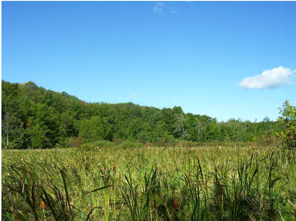
Wet Meadow on Bennett Creek Forest CE #2