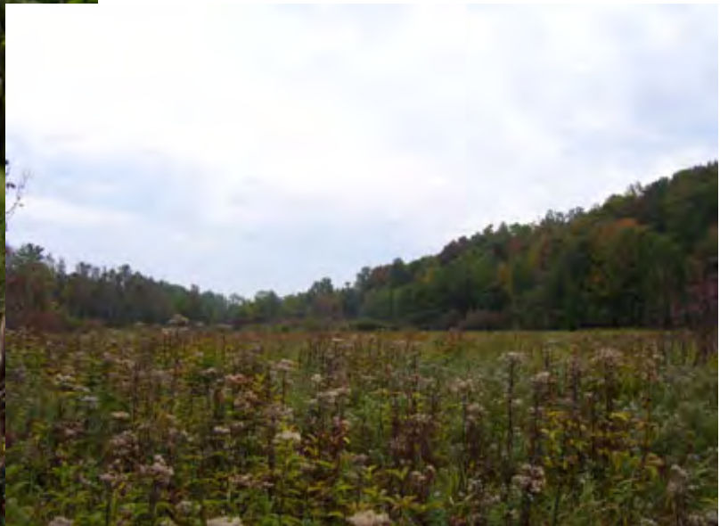
Wet meadow in interior of Bennett Creek CE #3