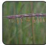
Big Bluestem Andropogon gerardi