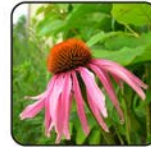
Purple Coneflower Echinacea pallida