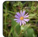
Smooth Aster Aster laevis