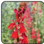
Cardinal Flower Lobelia cardinalis