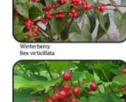
Winterberry Ilex verticillata