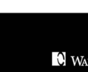
Ninebark Physocarpus opulifolius