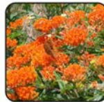
Butterfly Milkweed Asclepias tuberosa