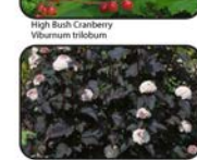
High Bush Cranberry Viburnum trilobum