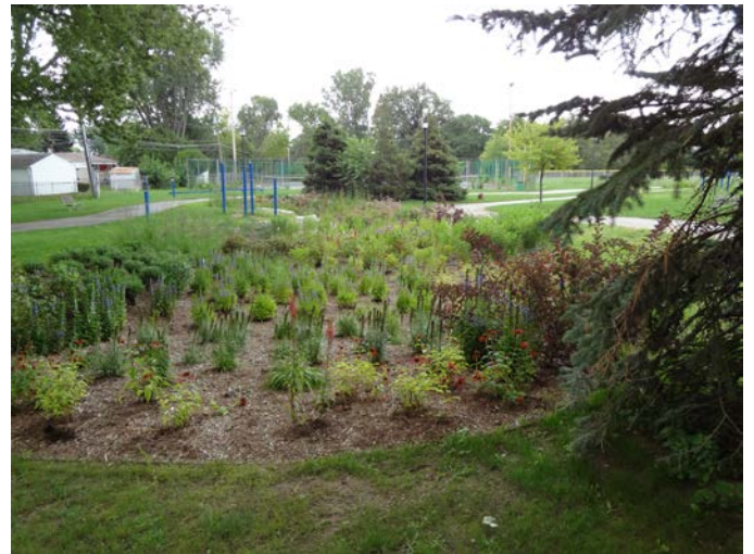
After Photo: Rain Garden No. 3.