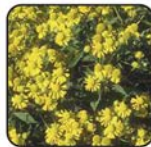
Sneezeweed Helenium autumnale