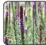
Marsh Blazingstar Liatris spicata