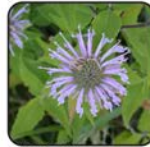
Wild Bergamot Monarda fistulosa