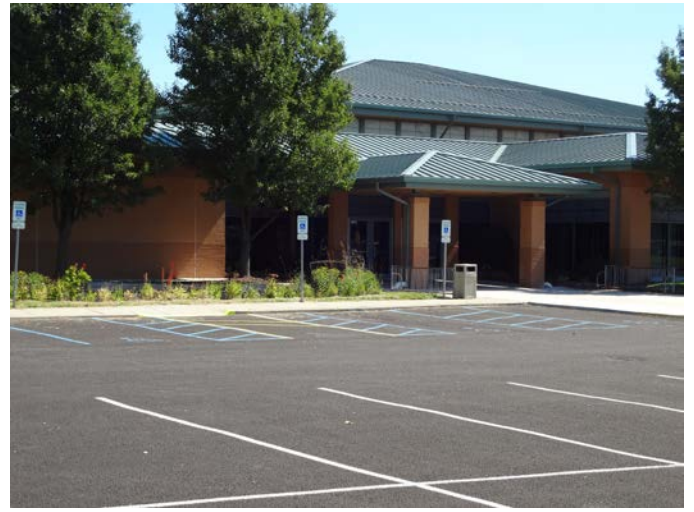
After Photo: Rain Garden No. 1 and Parking Lot