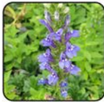
Blue Lobelia Lobelia siphilitica