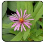
New England Aster Aster novae-angliae