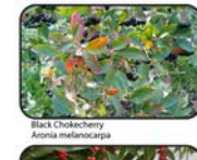
Black Chokecherry Aronia melanocarpa