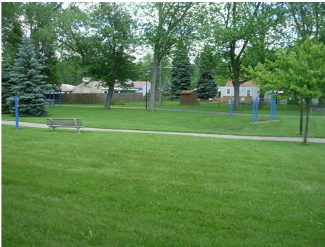
Before Photo: Rain Garden No. 3.