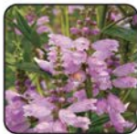
Cleopatra Plant Physostegia virginiana