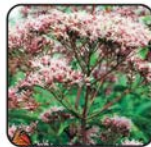
Joe-Pye Weed Eupatorium maculatum