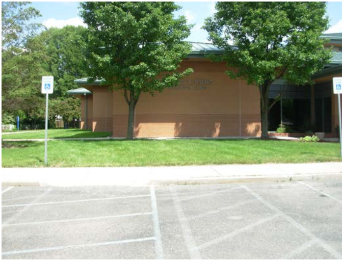
Before Photo: Rain Garden No. 1 and Parking Lot.