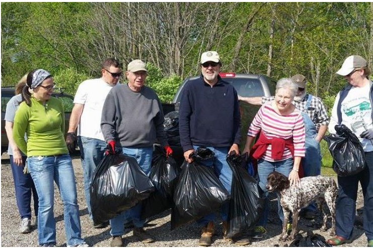
The Flat River Watershed Council River Cleanup in Lowell, Spring 2016.