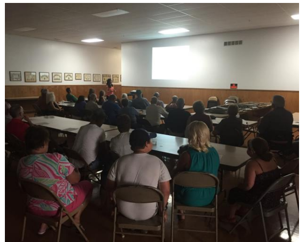
Public Meeting held in the Six Lakes Area of the Flat River Watershed. Attendees provided valuable input on watershed conditions and lifelong trend observations of the watershed and are interested in having more watershed information.