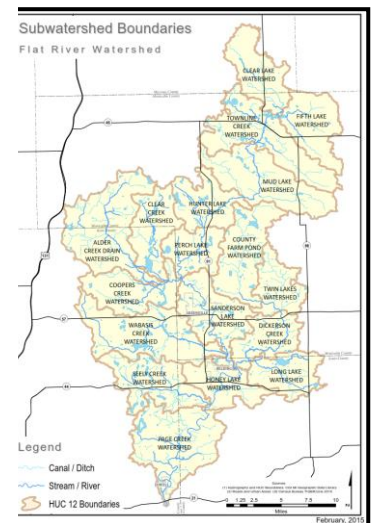
Locational maps of the Flat River Watershed in the West Central portion of Michigan's Lower Peninsula