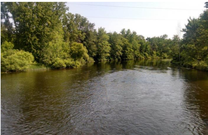
The Flat River photographed from the Smyrna Bridge. The Natural Rivers Act, where adopted, helps protect a 400 foot corridor on either side of the river in designated areas.