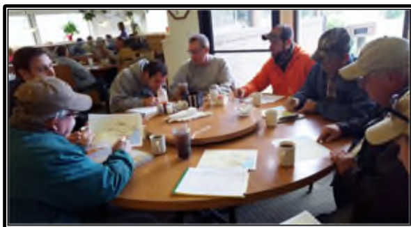
Stream walk training, October 2015