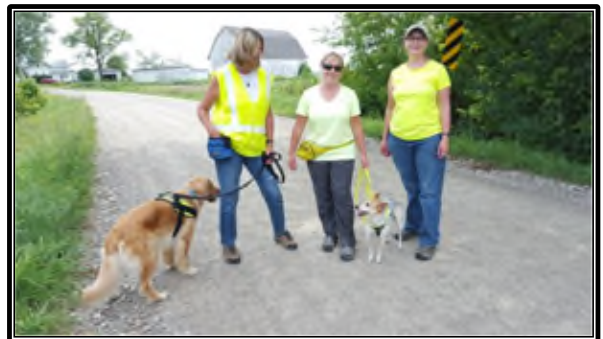
Environmental Canine Services, LCC stream survey, August 2015