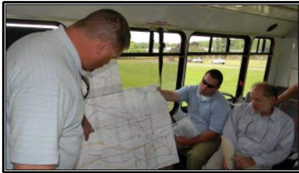
SS Lapointe Drain Watershed tour, June 2014