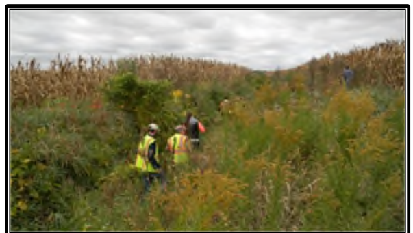
Stream walk assessment participants, October 2015