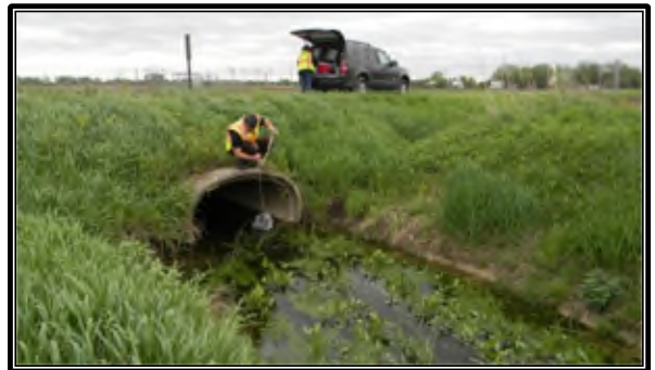
Water quality sampling activities, May 2015