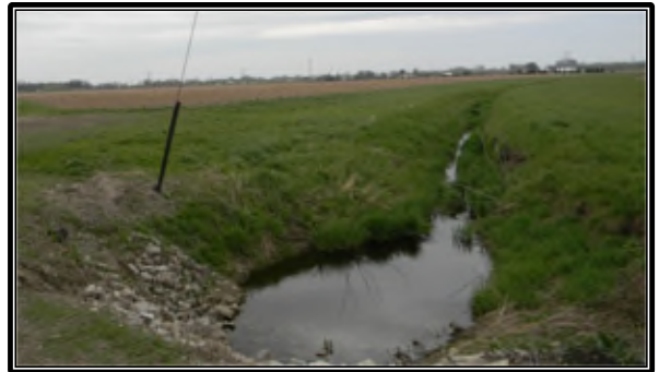
Example of riparian buffer at North Branch Wenrick & Cousino Drain, May 2014