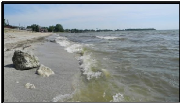
Luna Pier Beach, June 2015