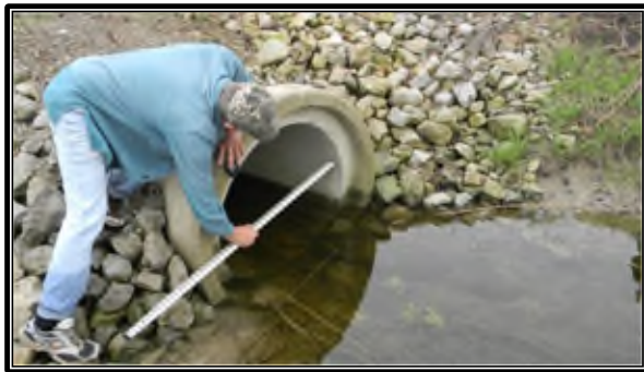
Water quality sampling activities, May 2015