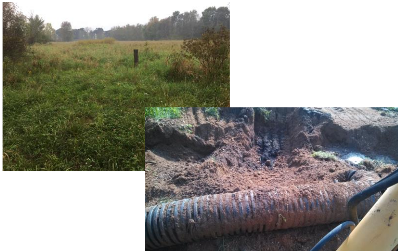
Before/During: This site had three drains connecting a wetland area to the Eagle Lake Drain.