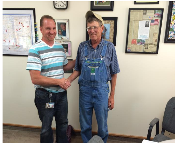
A 22-acre conservation easement signed between a landowner and Van Buren County Drain Office.