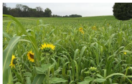
Cover crop - cocktail mix (drilled August 2015).