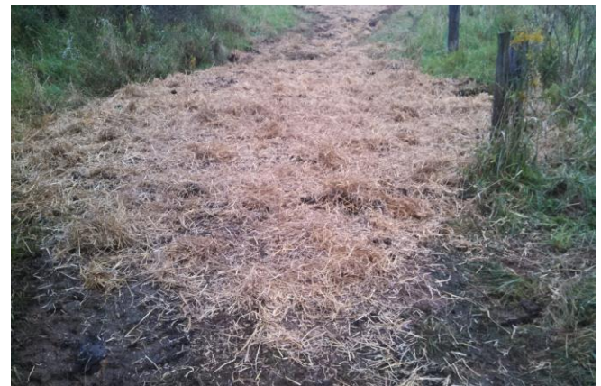
After: The drainage pipes were removed, eliminating the direct connection between the wetland and the Eagle Lake Drain. This restoration reduce runoff volume and sediment and nutrient loading.