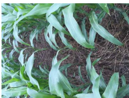
No-Till corn planted into soybean and ryegrass stubble.