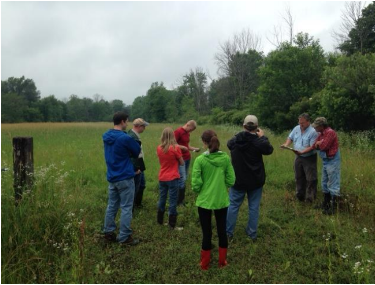
A farmer discussing a wetland restoration/floodplain reconnection and conservation easement on his property with project partners.