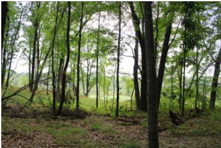
Thomas: Permanent Conservation Easement