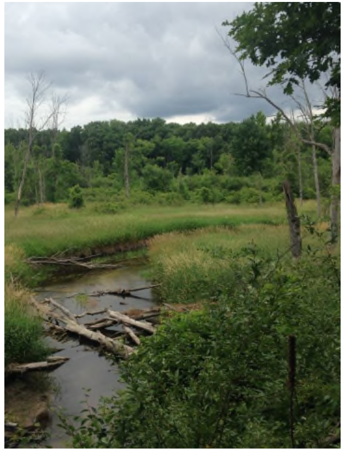
Toma: Permanent Conservation Easement