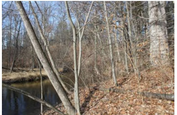
Nester: Permanent Conservation Easement