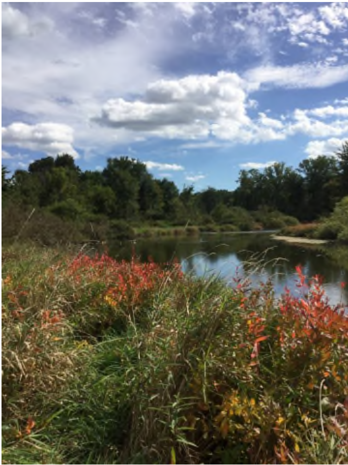
Coppa: Permanent Conservation Easement