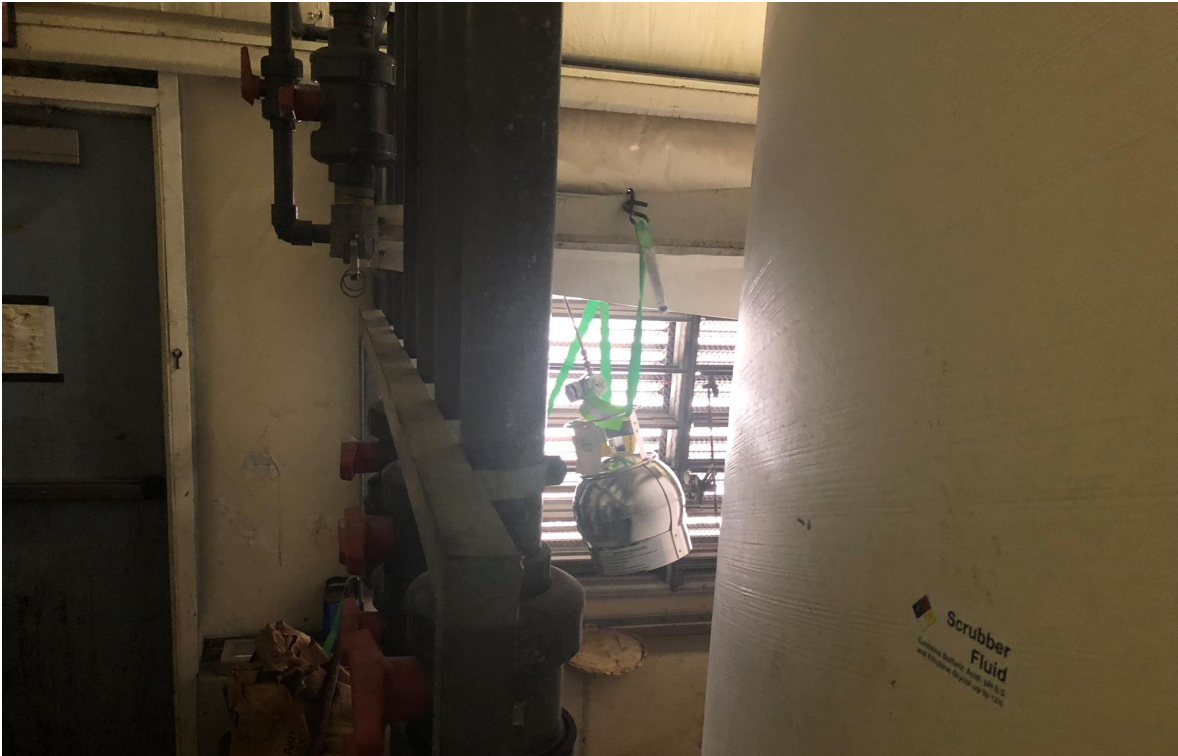
Photo 5: View of sample collection at indoor air (IA) location within scrubber room.