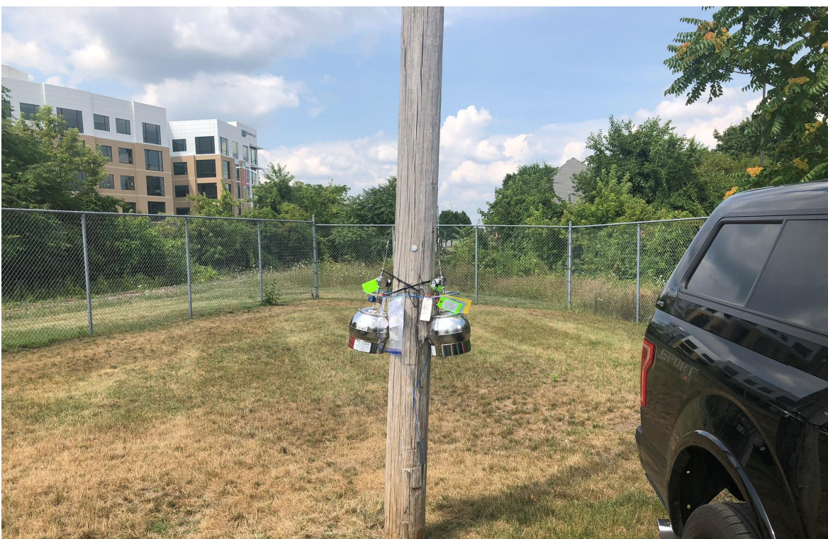
Photo 4: View of co-located sample collection at location #4, facing north.