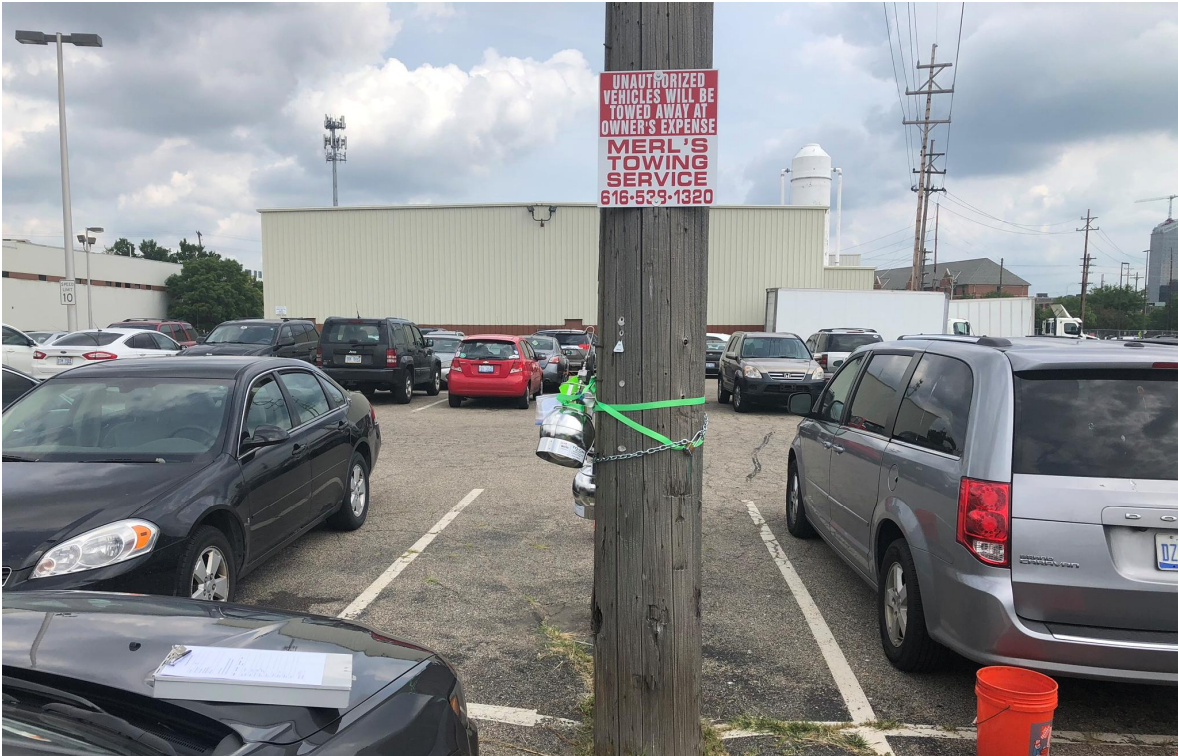
Photo 1: View of sample collection at location #1, facing north. Sample collected by the Michigan Department of Environment, Great Lakes, and Energy (EGLE) also pictured (lower canister).