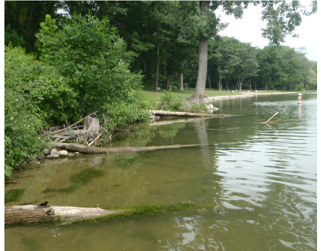
Coarse woody structure project installed as part of the Michigan Natural Shoreline Partnership Certified Natural Shoreline Professional (CNSP) Training.

Restore shoreline woody structure to the nearshore area of your lake. Root wads, logs, and whole trees can be installed as shoreline woody structure, but don't use trees that are currently growing near the shoreline, because they are stabilizing it from erosion. It is best to use recently live trees. The structure must be securely anchored. EGLE recommends placing woody structure 100 feet away from docks, boat ramps, and designated swimming areas. Below is one installation strategy that uses posts and cable to anchor trees to the shoreline.