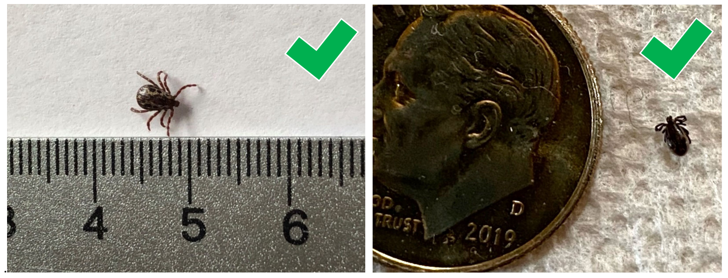
Photographing the tick against a solid white (or light colored) background works best. Including a ruler or object with a standardized size like a coin can help us identify your tick.

Since starting our email tick ID program several years ago, we have received hundreds of tick photos from Michigan residents. Many of these photos have been excellent, and some have been.... less than excellent. We understand that ticks are small and can sometimes be difficult to photograph. In order to help you avoid frustration and get good-quality photos, we have put together this guide to illustrate some helpful tick photo tips.