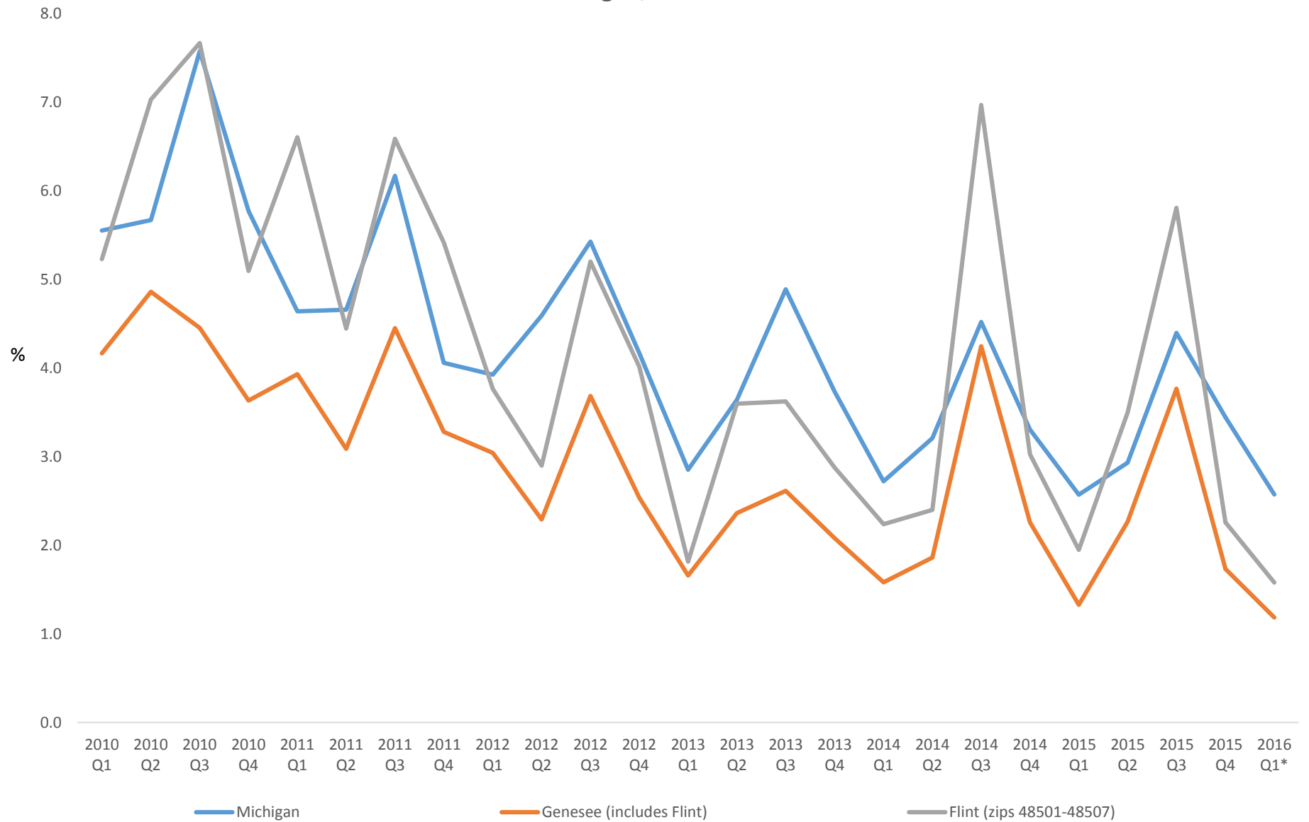
Incidence of elevated blood lead \geq 5 mcg/dL among children < 6 years of age by quarter, Michigan, 2010-2016

*Data for Quarter 1 of 2016 is subject to change.