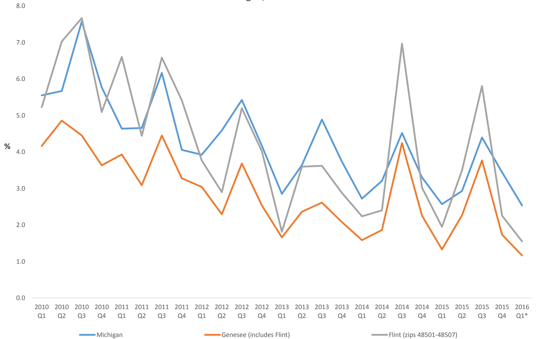
Incidence of elevated blood lead \geq 5 mcg/dL among children < 6 years of age by quarter, Michigan, 2010-2016

*Data for Quarter 1 of 2016 are subject to change.