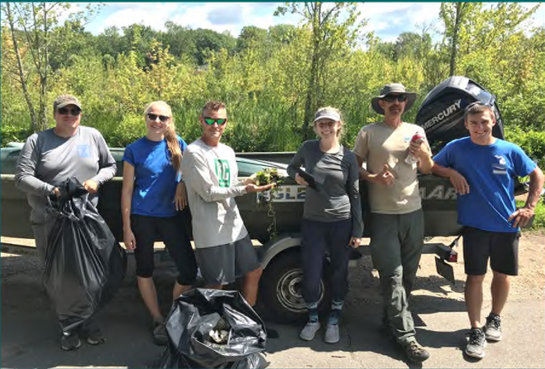
EGLE Water Resources Division staff and West Michigan Cisma staff have been working together since 2016 to eradicate European Frog-bit from Reeds Lake, Kent County.