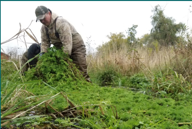
Hand removing parrot feather at a site in Fall of 2017 improved 2018 herbicide treatment. A few parrot feather stems were found and removed in 2019. No parrot feather was found here in 2020.

Engaging local stakeholders and aquatic plant management professionals is an essential part of the EDR initiative. Working with property owners, municipalities, and Cooperative Invasive Species Management Areas (CISMAs) increases capacity to respond to infestations, supports consideration of local values, and increases awareness of watch list invasive species. Partners are critical in project planning and execution. Effective partnerships enable the EDR initiative to bring together statewide perspectives and local expertise.