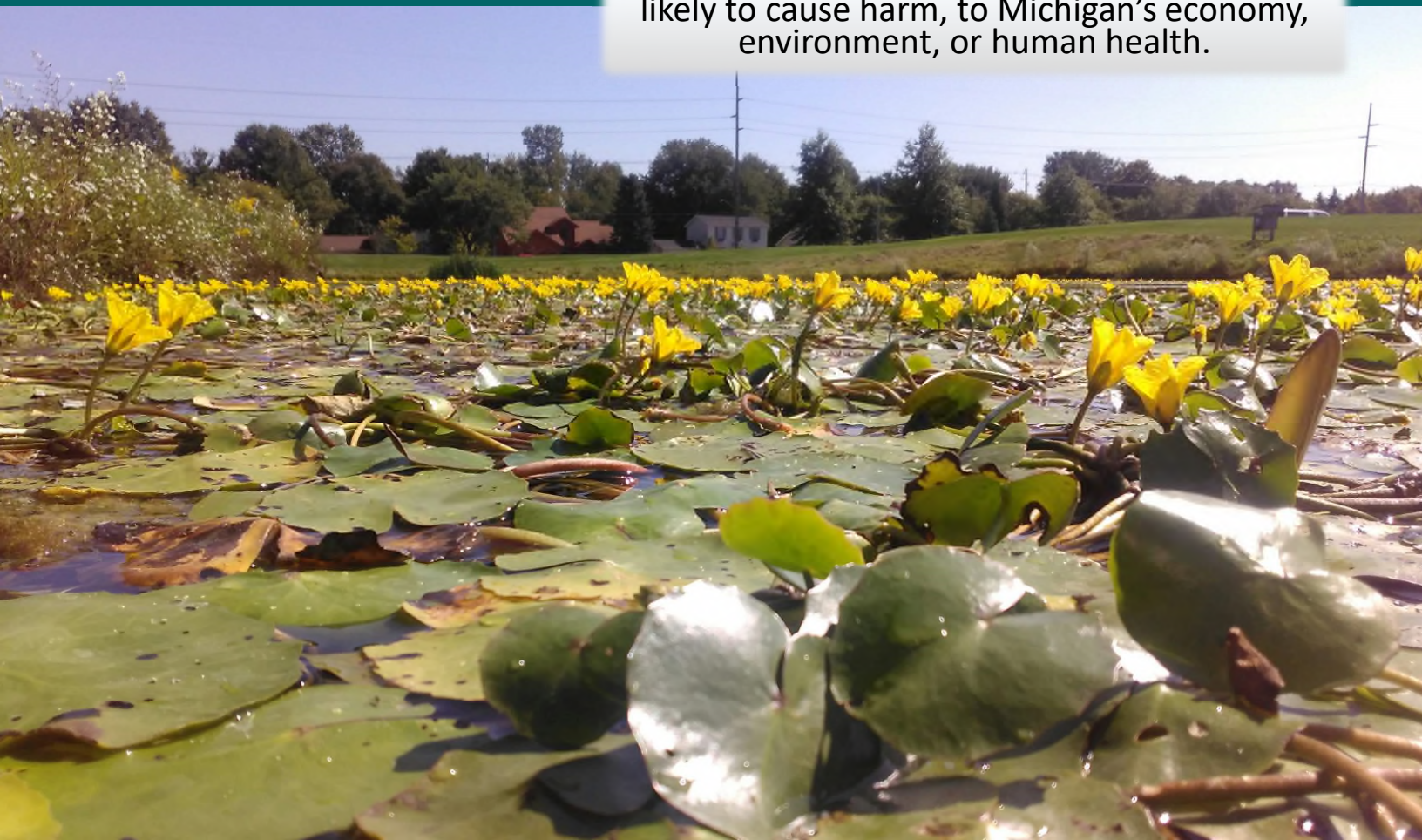
Yellow Floating Heart infestation, Allegan County, MI.

An invasive species is one that is not native and whose introduction causes harm , or is likely to cause harm, to Michigan's economy, environment, or human health.