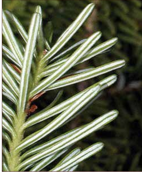
Balsam fir.

found in a few locations in Michigan at this time. Many people who check their hemlock trees may notice small, white spots that look a bit like hemlock woolly adelgid. Other insects, including the elongate hemlock scale, oak skeletonizer cocoons, caterpillar cocoons or spider egg sacs may be present on hemlock needles or shoots. Compare the pictures of hemlock woolly adelgid with the