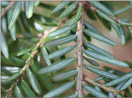
Eastern hemlock.

easiest way to identify hemlock woolly adelgid is to look at hemlock shoots for the white “wool” the adelgid produces while feeding. Each little white ball of wool, called an egg sac, is actually wax secreted by an adelgid. The adelgids feed at the base of the needles, where the needles attach to the woody portion of the shoot. It is often easier to see hemlock woolly adelgid wool on the undersides of shoots, but you can also find them on the upper side as well.