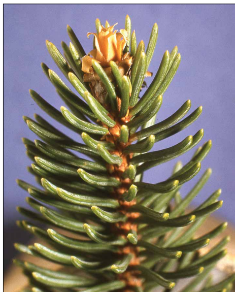
White spruce.

It is critical to be sure you correctly identify whether or not your tree is a hemlock because hemlock woolly adelgid is only found on hemlocks. Once you are sure your tree is a hemlock, you will need to be able to recognize hemlock woolly adelgid. A few other insects can be confused with hemlock woolly adelgid. The