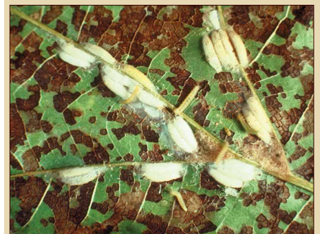
Oak skeletonizer COCOONS.