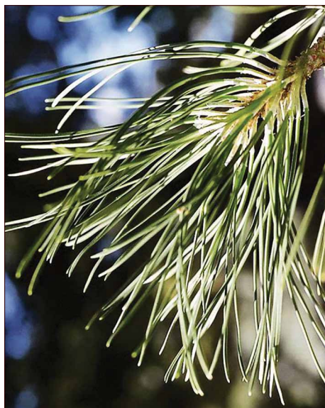
Austrian pine.