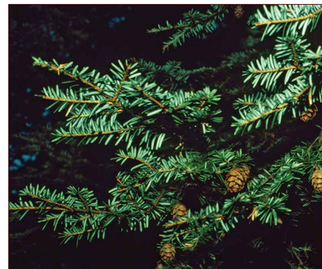
Healthy hemlock tree.

The only other conifers with short, flat needles are firs and Douglas fir, which is technically not a fir. Eastern hemlock needles can be distinguished from fir needles by their shape: they are slightly wider at the base and taper to a rounded tip with a dull point, while fir and Douglas fir needles have parallel sides for nearly the entire length of the needle.