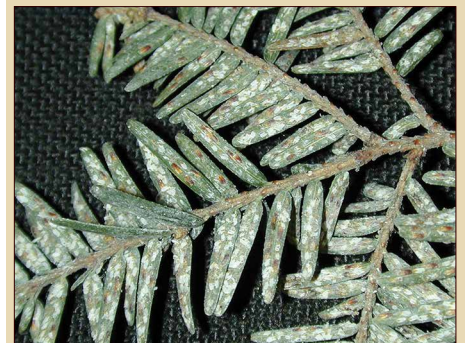
Elongate hemlock scale.