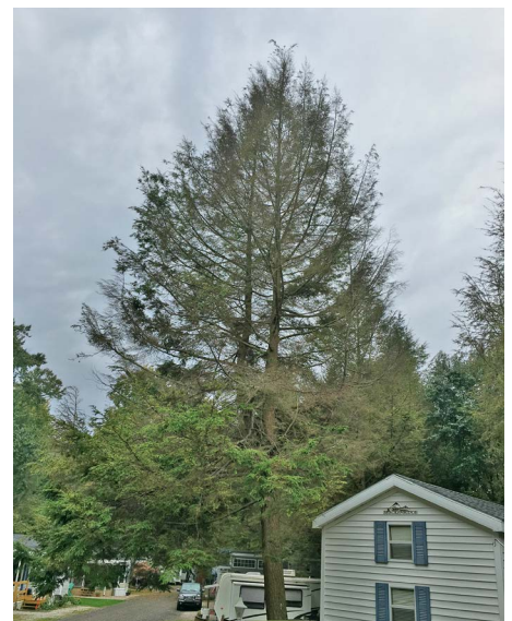
This declining hemlock tree has been severely affected by hemlock woolly adelgid.