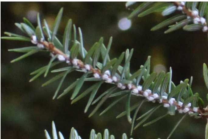
White waxy ovisacs of hemlock woolly adelgid will be found at the base of needles.