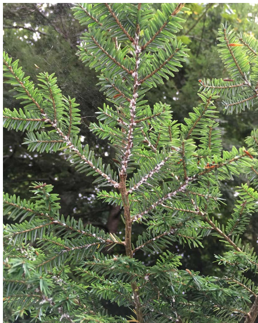
White waxy ovisacs of hemlock woolly adelgid.