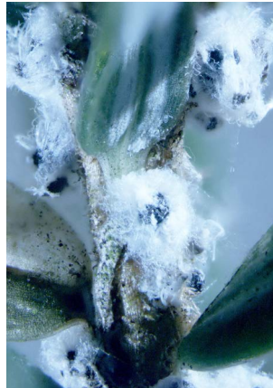
Filaments of wax are secreted by hemlock woolly adelgids as they feed.

winter temperatures have caused some HWA mortality in the eastern United States, but populations may build back up within a few years. Although hemlock woolly adelgids cannot fly, life stages can be blown by the wind or transported on birds, animals or even on clothing. Long-range spread of HWA occurs when people transport and plant infested hemlock nursery trees into new areas.