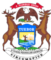
RICK SNYDER GOVERNOR

Department of Licensing and Regulatory Affairs Bureau of Fire Services