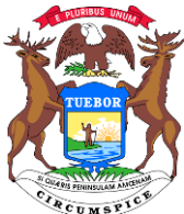
GRETCHEN WHITMER GOVERNOR