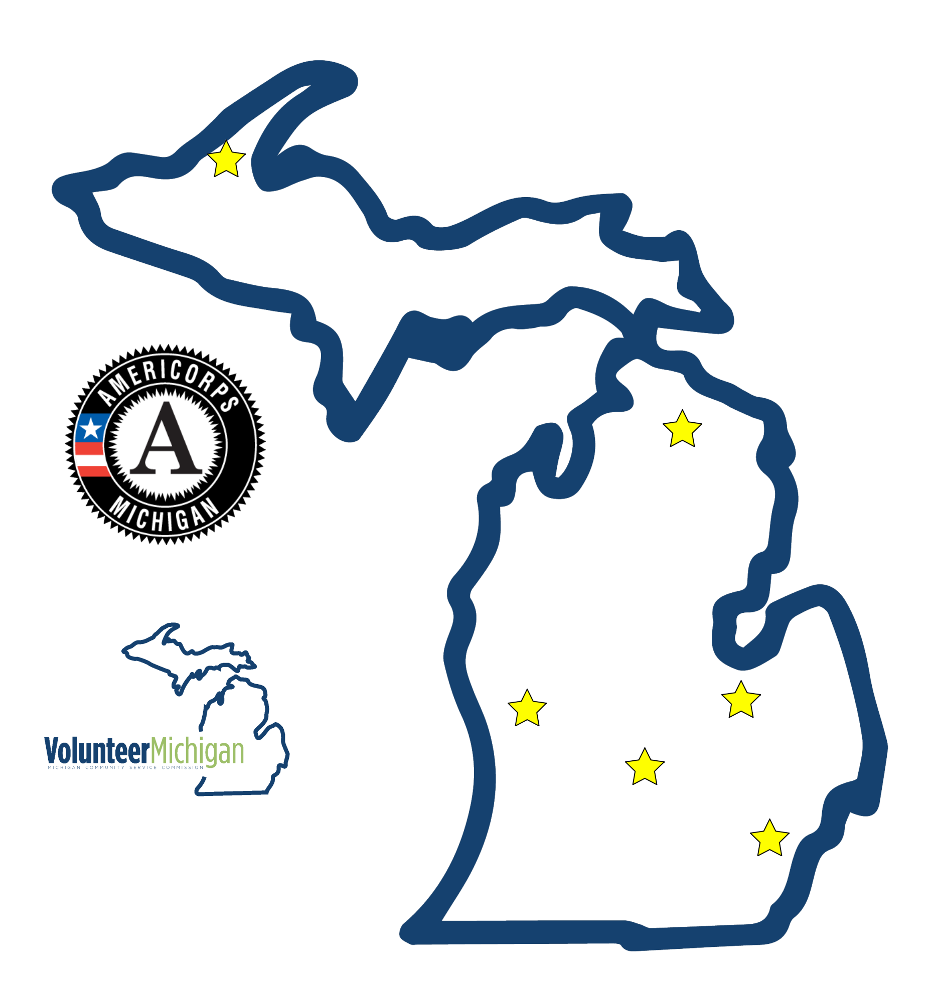
The 2017 RMSSP engaged 724 AmeriCorps members and community volunteers in service across Michigan.