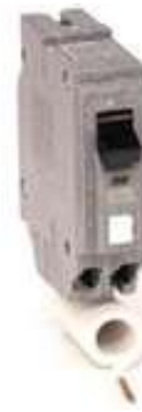
GFCI Circuit Breaker