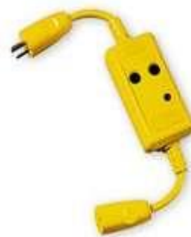
Inline GFCI for Cords