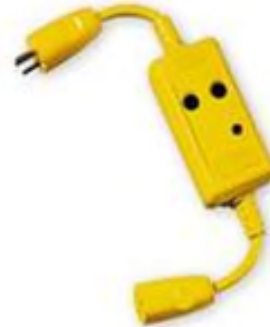
Inline GFCI for Cords