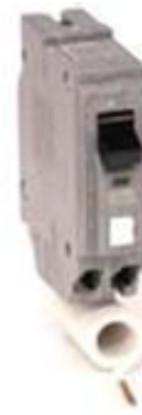
GFCI Circuit Breaker