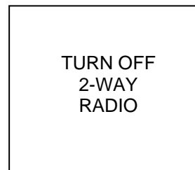
About 42" x 36"