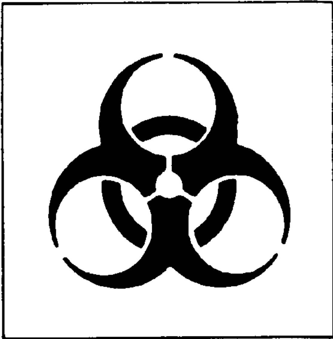
FIGURE 2 BIOLOGICAL HAZARD SYMBOL CONFIGURATION

(2) The symbol design for biological hazard tags shall conform to the design shown below in Figure 2: