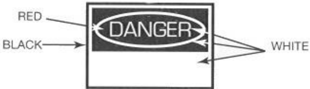
Figure 1 Danger Sign