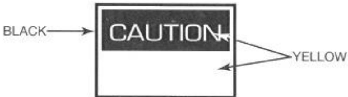
Figure 2 Caution Sign