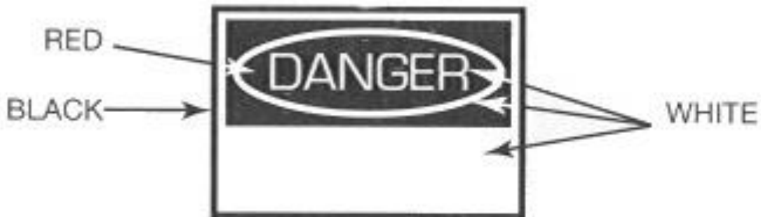
Figure 1 Danger Sign