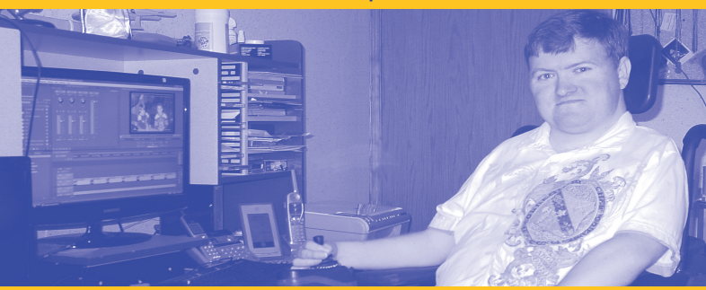
Timeless DVD Memories