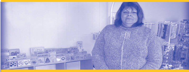
Come Scrap with Me