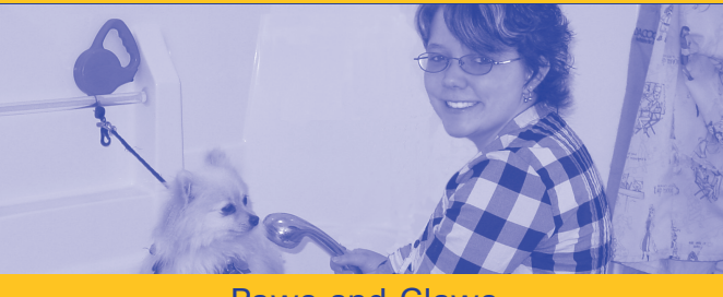
Paws and Claws