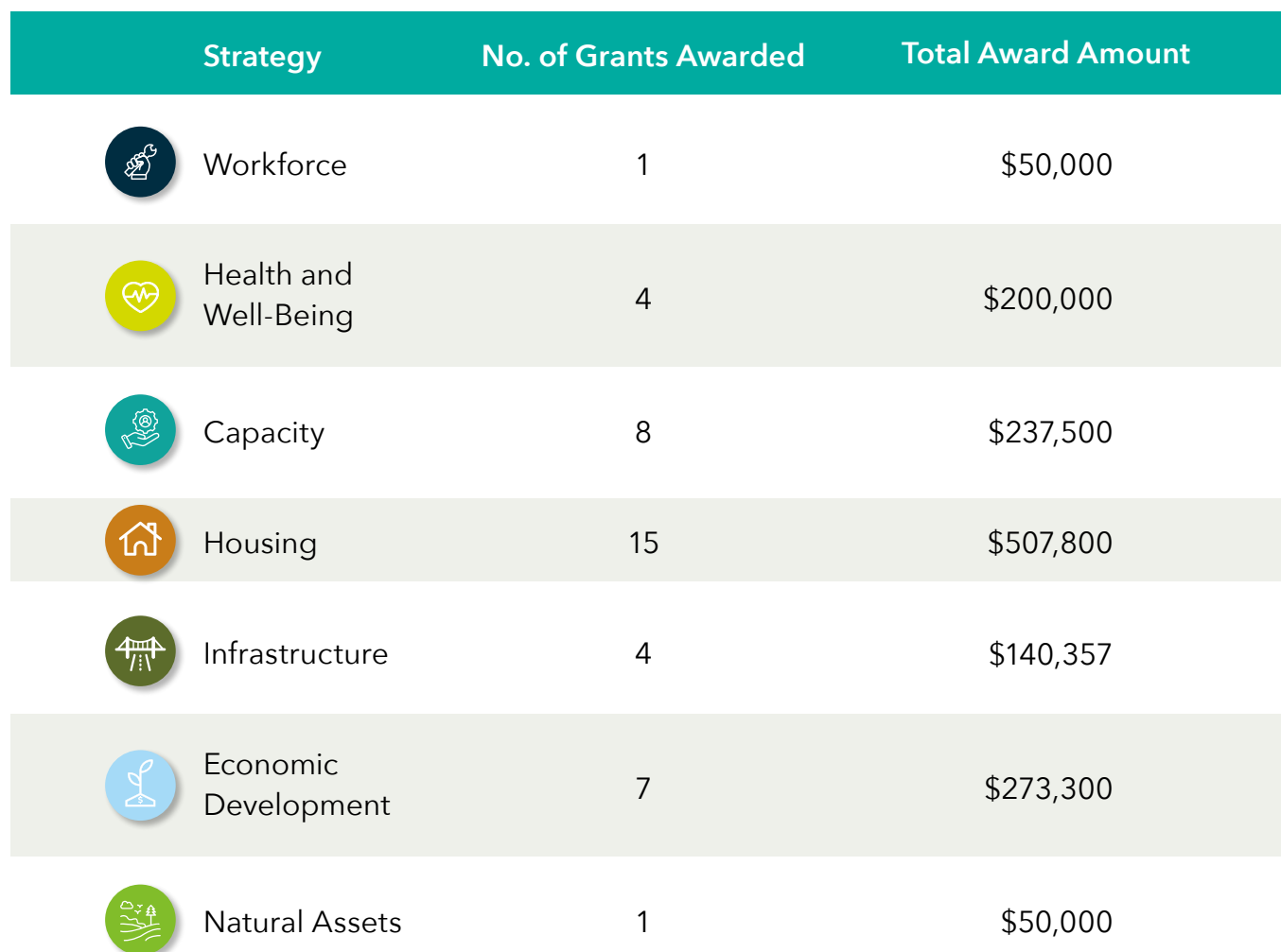
Table 01. Forty awards totaling an investment of $1.8 million were awarded in 2024. These projects advanced each of the seven strategies found in the roadmap.

intentionally designed with the unique needs of rural communities in mind – a streamlined application, flexible grant match requirements and simplified reporting processes allow communities to build readiness for future development without depleting capacity.