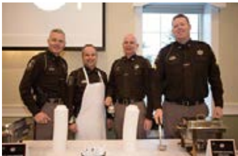
Muskegon County Sheriff's Deputies

An essential underpinning of law enforcement licensure in Michigan, as well as in most other states, is valid law enforcement employment. MCOLES and its predecessor, the Michigan Law Enforcement Officers Training Council, lacked an effective mechanism to track law enforcement officer employment prior to 1998. The reporting requirement of Public Act 237 provided the remedy.