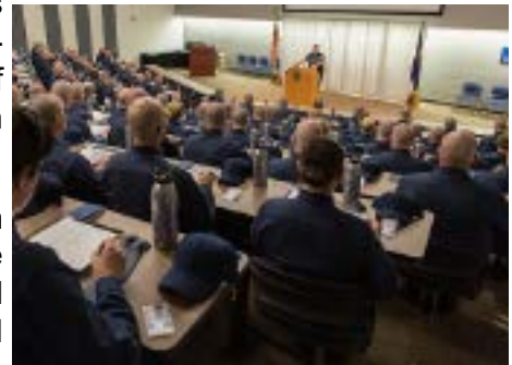
Michigan State Police

There are three training delivery sites in Michigan that train only their own employed recruits. They are the Michigan State Police (MSP) Academy, the Michigan Department of Natural Resources Law Enforcement Division (DNR) Academy, and the Detroit Metropolitan Police Academy (DMPA).