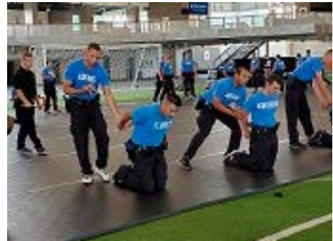
Grand Valley State University

Upon successful completion of the Pre-Service Training Program and passing the MCOLES licensing examination, the candidate may apply for employment with any Michigan law enforcement agency. Pre-Service Training Program graduates are eligible to be screened for standards compliance, employment and licensure with a law enforcement agency as a fully empowered law enforcement officer for one year after graduation from a basic training academy.