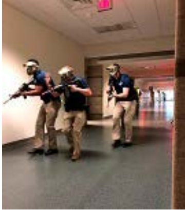
Mid-Michigan Academy recruits simulate an active violence response scenario