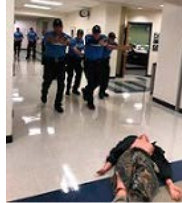
Grand Valley State University recruits simulate an active violence response scenario

Additionally, agencies that have developed an in-house program are asked to contact MCOLES to obtain recognition. The recognition process requires a copy of the courseware. Basic requirements of the training include: