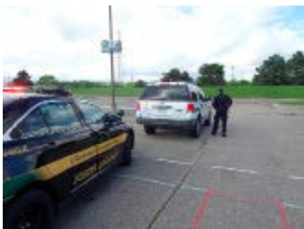
Washtenaw Community College

In 1965, the legislature recognized the need to provide training to employed recruits and eligible preservice candidates for agencies that did not have the means to administer a training program. Therefore, training delivery sites were identified based on regional need across the state.