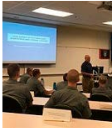
Grand Valley State University recruits participate in in-class instruction for active violence response training