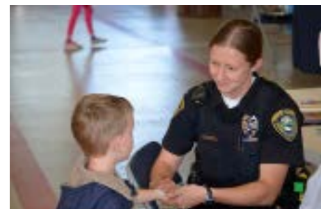
Norton Shores Police Officer

The information provided in the MCOLES personnel registration process serves law enforcement well. It provides law enforcement employers with verified histories of law enforcement employment in Michigan. Second, this process streamlines the registration system for the law enforcement distribution. Finally, it enables various assessments of Michigan's law enforcement population to determine demographic trends and to predict future training needs.