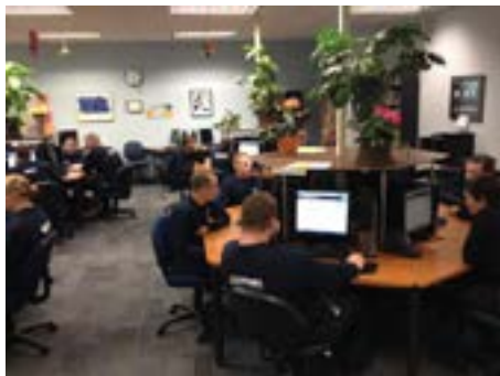
Recruits from Lake Superior State University taking the MCOLES licensing exam.

Although all recruits must pass the MCOLES licensing exam to become licensed, this is not the sole determinant of skills mastery. One test cannot fully evaluate recruit competencies. Accordingly, MCOLES requires that all academies administer periodic written examinations to their recruits, including a comprehensive legal examination near the completion of the school, in addition to individual skills assessments (firearms, emergency vehicle operations, subject control, first aid, and physical fitness). The recruits are assessed throughout their academy experience in a variety of events in order to measure their suitability for the profession.